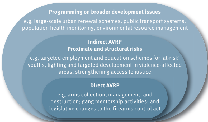
FIGURE 1 Categorizing AVRP activities

Figure 1.1 provides an illustration of the ways in which ‘direct’, ‘indirect’, and broader development initiatives can be distinguished. In practice, the lines between ‘direct’ and ‘indirect’ approaches are blurred, with many cutting-edge AVRP programmes combining elements of both approaches.