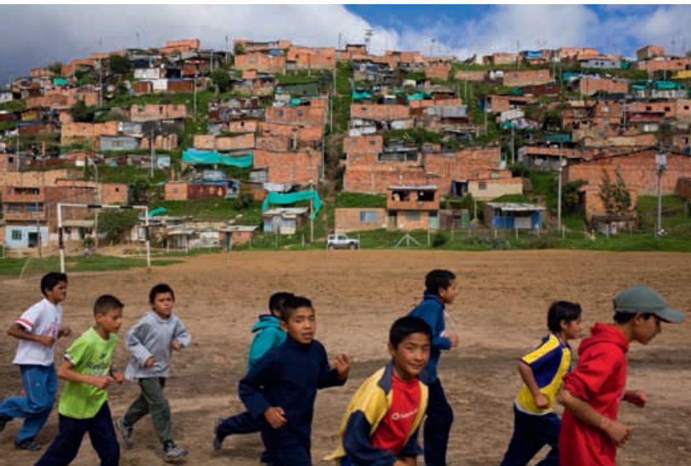
Children take part in a 'Goals for a Better Life' training session, an initiative set up to keep young people in school and out of gangs, Bogotá, May 2007.

Much research has been undertaken on the risk factors for youth violence and on those factors that can prevent youths from engaging in violence. 34 A key conclusion is that intervention at the infant and early childhood stages