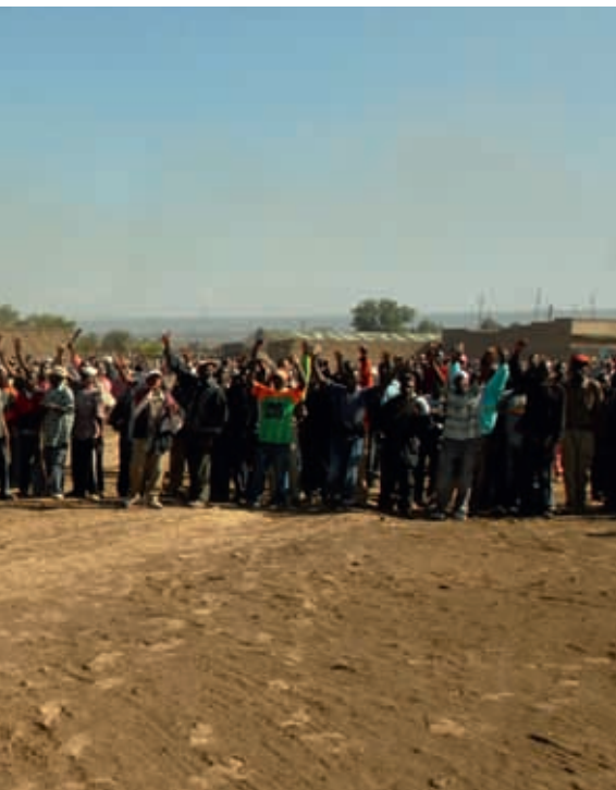
A Masai leader approaches a group of Kikuyus to broker a peace agreement following post-election violence in Naivasha, Kenya, January 2008.

(see Box 33). Several CSOs, including, for example, Pastoralist Community Initiatives and Development Assistance in Kenya, are engaged in local peace-building initiatives among nomadic cattle herders in northern Kenya and along the Kenya–Ethiopia border (Comunidad Segura, 2010a).