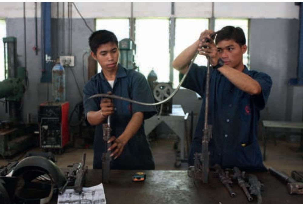
Two young men learn how to make furniture from machine guns following a disarmament programme in Cambodia.

significant crime or violence reduction associated with buy-back schemes and that, without measures preventing access to new weapons, such schemes only reduce the number of firearms in circulation temporarily and may actually increase firearms holdings by lowering ownership costs and stimulating demand for new weapons. 16