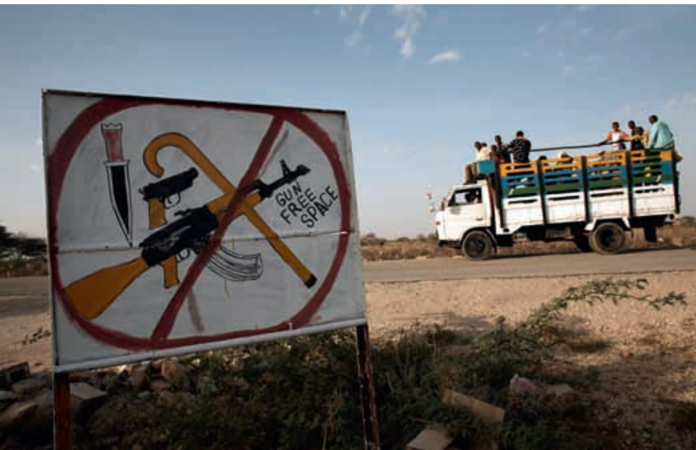
A signpost declares a 'gun free space' on the road approaching Burao, Somaliland, July 2007.