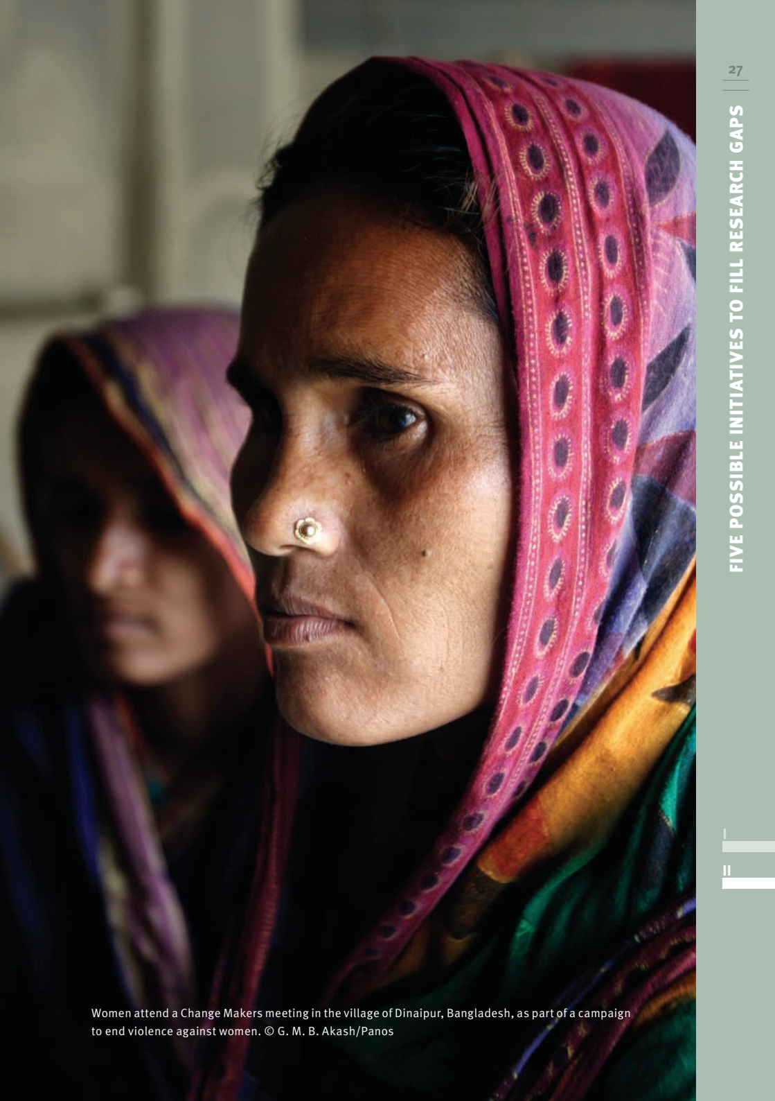
Women attend a Change Makers meeting in the village of Dinaipur, Bangladesh, as part of a campaign to end violence against women.