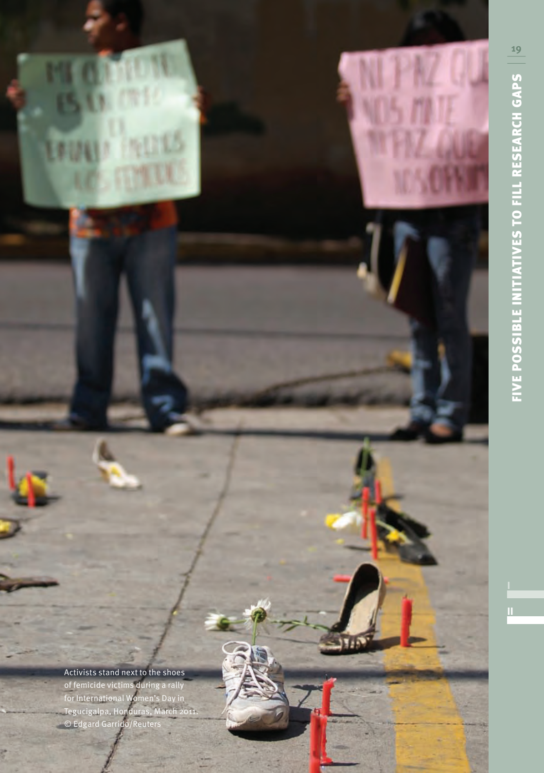
Activists stand next to the shoes of femicide victims during a rally for International Women's Day in Tegucigalpa, Honduras, March 2011.