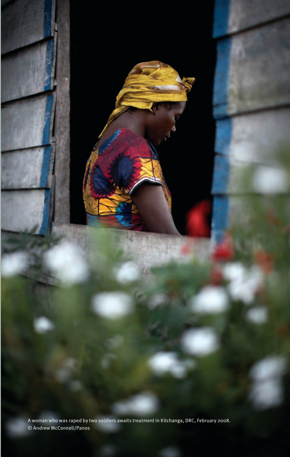
A woman who was raped by two soldiers awaits treatment in Kitchanga, DRC, February 2008.