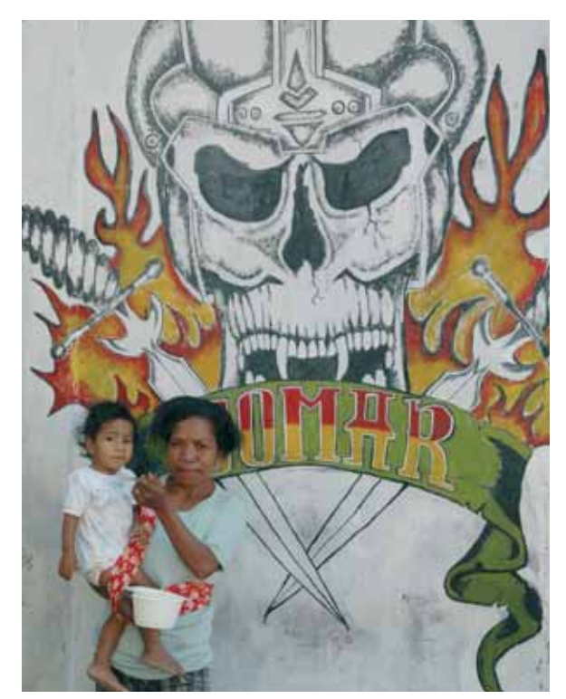
Mother and child standing in front of gang insignia, Dili, 2008

Timorese group and gang violence has fluctuated over time, but there is strong evidence that membership in these groups has diversified and grown in recent years. The government and civil society have taken a number of steps to manage and mitigate this development, but weak political will, coordination, and financial commitment have limited the scope of initiatives. This is worrying, as more