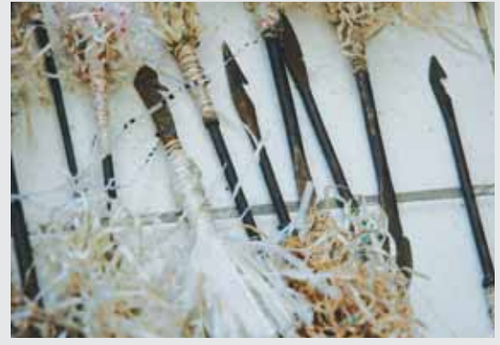
Rama ambons collected in police raid, Dili, 2008

While gang members sometimes speak of unofficial rules of engagement that forbid the use of manufactured guns, there is no doubt that, with links to the security forces, all the major gangs have access to such weapons. One factor discouraging gun use may be that communal disputes sometimes pit former friends and neighbours against one another, and resistance is strong to seriously injuring a former friend.