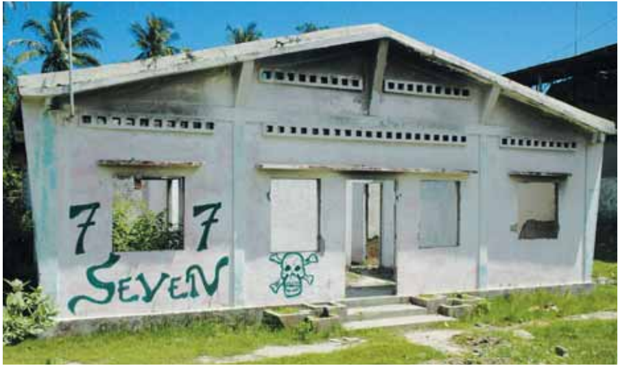
Gang graffiti on an abandoned house, Dili, 2008

like patronage networks associated with a particular figurehead. Frequently, these figures are ex-clandestine activists or leaders, or heads of family networks. Under the Indonesian occupation, many clandestine networks were based on kinship networks,11 and many contemporary gangs are similarly structured. The leaders of these gangs also cultivate loyalty through patronage such as loans, cigarettes, or alcohol, or through fear. Many of these figures operate extortion rackets, distributing their gains in the local community to further their own status. Youth are not necessarily paid to carry out criminal acts but may be motivated more out of loyalty and obligation. When political parties or business figures need to organize a crowd these figures act as procurers or fixers. About a half a dozen powerful Dili-based figures have broad power bases, and may call on lesser, more localized figures to organize youth into mobs, for example, to target internally displaced person (IDP) camps or intimidate a business rival.