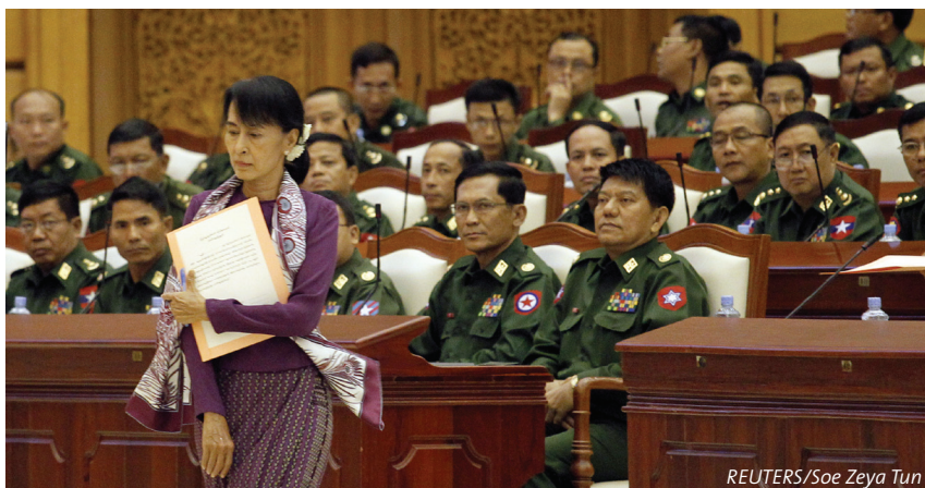
Aung San Suu Kyi walks to take an oath at the lower house of parliament in Naypyidaw, 2 May 2012

After decades of military rule, Myanmar is experiencing a remarkable period of political change. There are, however, limits to democratisation at this stage, as the reform process is largely controlled by military leaders. Myanmar's efforts to reduce its dependence on China and engage more closely with the global economy have given rise to international competition for influence and access to the country's natural resources. Still, given the uncertainties about Myanmar's political future, Western countries should proceed cautiously.