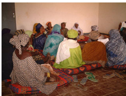
A women session in progress in Menaka