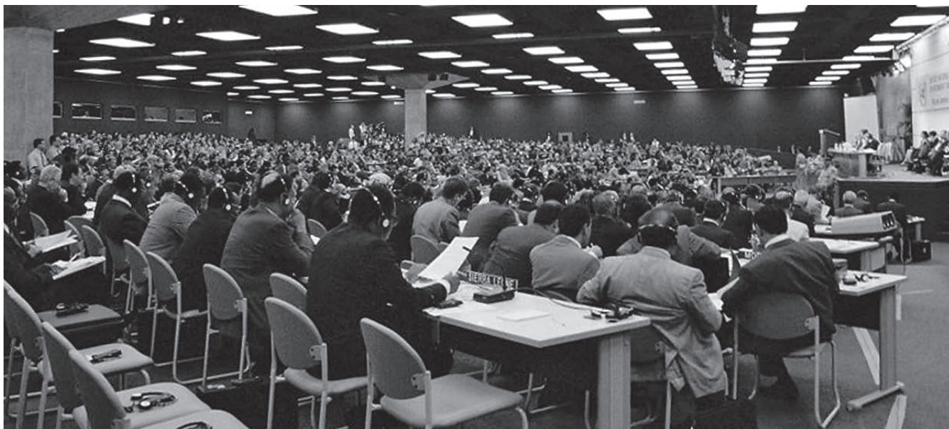
The very first Earth Summit, held in Rio in 1992, saw the launch the UN Framework Convention on Climate Change (UNFCCC) and the UN Convention on Biological Diversity (CBD).

purpose of the first Earth Summit in 1992 was to translate the idea of sustainable development into concrete action. Ideally, sustainable development implies two important changes in policy-making. First, it implies the ability to promote economic, social and environmental aspects of development simultaneously both at home and abroad. Second, it requires careful balancing between short-term interests and long-term values and principles. Consequently, this would require a new way of integrating politics into national and international negotiations.