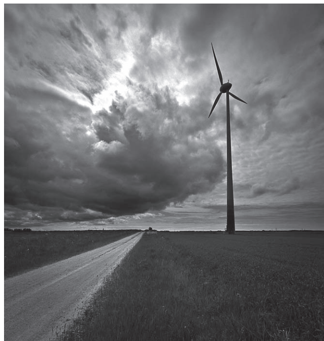
Wind turbine near Palanga, Lithuania.

lies in the breadth of the sustainable development agenda, which makes it very difficult to control and coordinate the member states' interests, as well as sectoral policy interests. In the absence of a solid common view on many of the details, instead of just adjusting its positions in the negotiations with the others, the EU has to negotiate its own contributions in parallel. This again puts a lot of pressure on Denmark, which is holding the Council presidency.