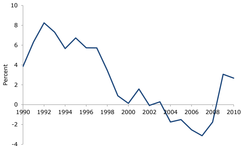
FIGURE 3 OECD Savings Rate for the UK, 1990-2010