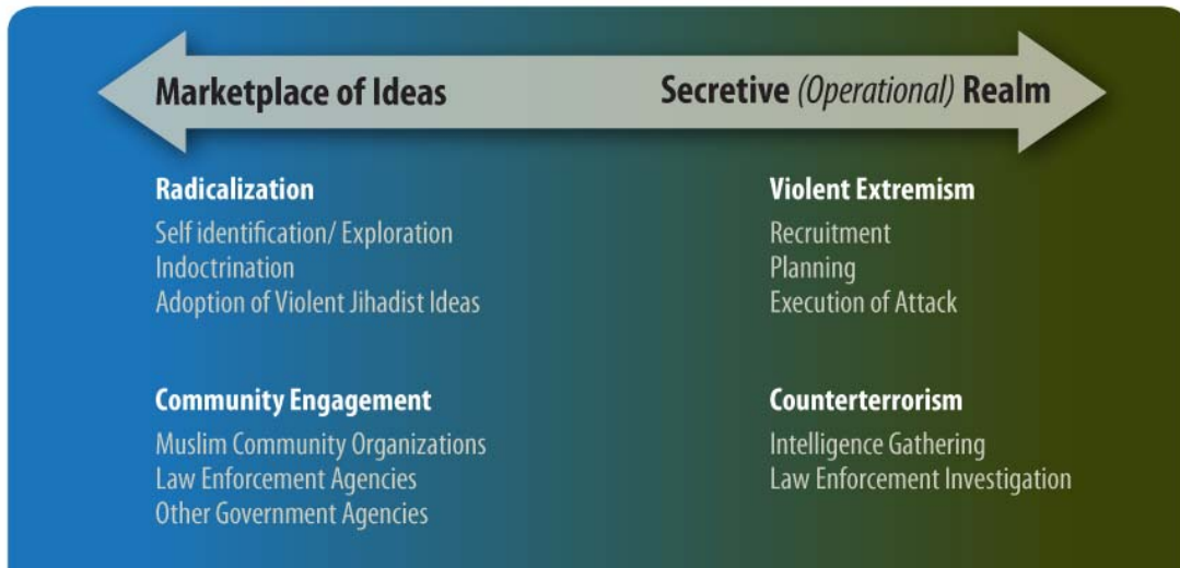
Figure 1. Counterterrorism Context