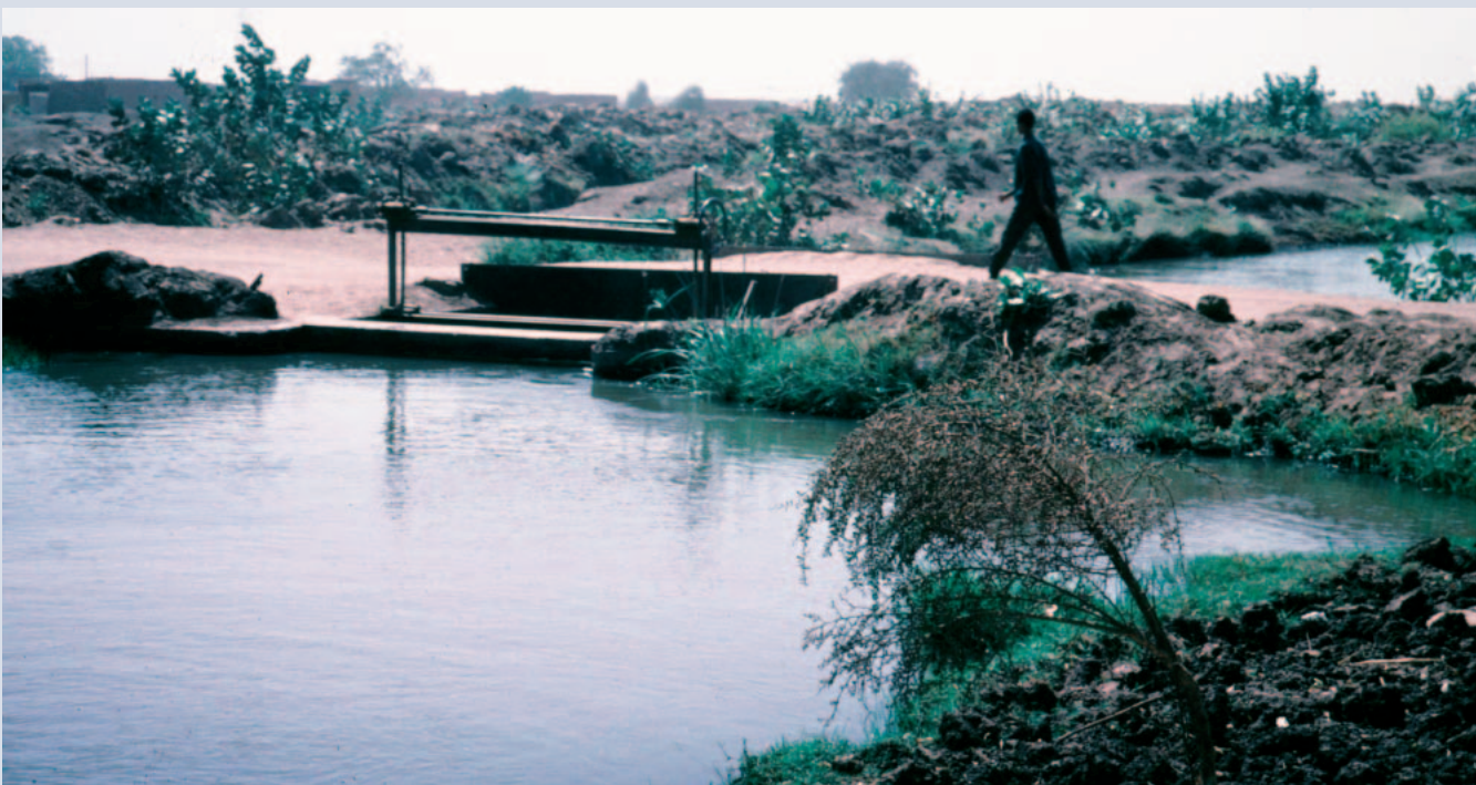
FIGURE 6 Large-scale irrigated area in Gezira, Sudan.

It is difficult to evaluate the impact of such a workshop series on the wider sociopolitical environment (Figures 5 and 6). Some indication can be deduced from the participants’ evaluations, which were very positive. The openness and the progress made by the participants during the workshops would not have been possible without positive steps towards coopera-