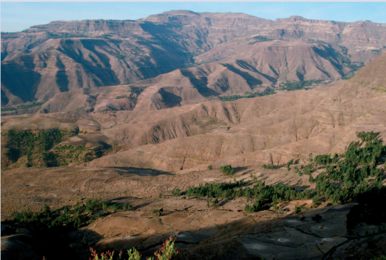
FIGURE 3 Small-scale rainfed agriculture in the Ethiopian highlands.

The workshop series was not intended to be a negotiation forum, as such fora