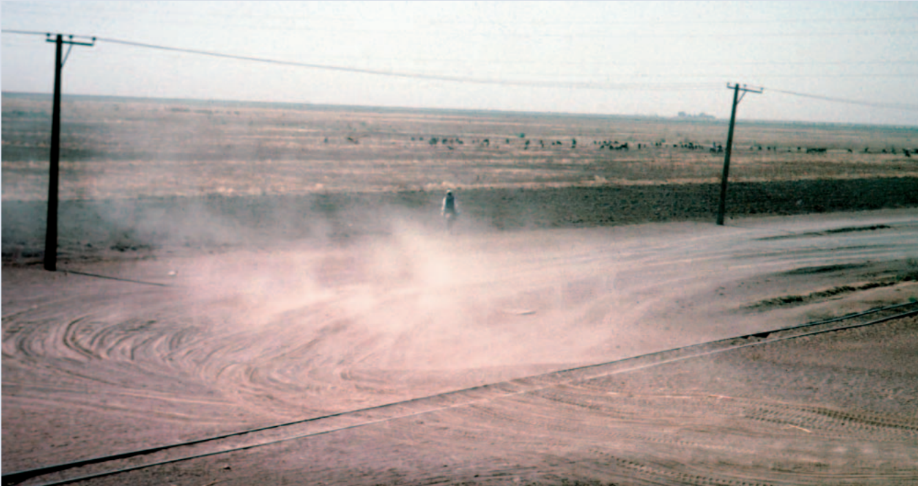
FIGURE 5 International conflict transformation workshops alone cannot solve water scarcity problems, which may be related to climatic fluctuations or irrigation mismanagement. Large-scale irrigated area in Gezira, Sudan, during a period with little water.

seen how an informal setting such as this could achieve more tangible outputs than a formal setting, which has a number of constraints.” Ideas were developed to enhance cooperation and development in the Eastern Nile Basin. These ideas entail future training events, with a mixed student body from the 3 countries, as well as activities to support development in the region in such a way as to keep ownership in the hands of the people living in the region.