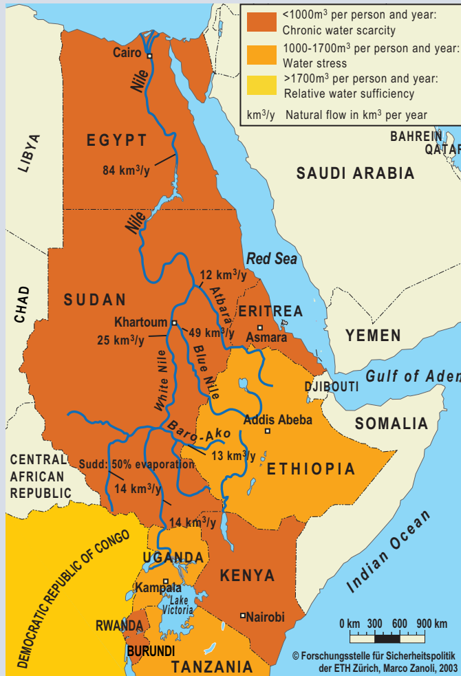
FIGURE 1 Projected water scarcity in the Nile Basin countries in the year 2025. The figures are based on UN population projections and FAO data of total actual renewable water per country; regional differences of water availability within a country are not considered. (Map by Marco Zanoli, Center for Security Studies, ETH Zurich; data: FAO and UNFPA).

assistance of an outside person who is accepted by the actors is often required.