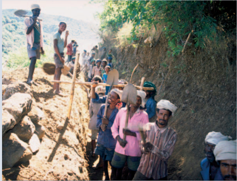
FIGURE 2 Digging an irrigation ditch in the Ethiopian highlands.

and one on the upstream perspective (Yacob Arsano). The aim was to prepare the groundwork for a specific project on the ground, ie a series of 3 Dialogue Workshops on international cooperation in the Eastern Nile Basin.