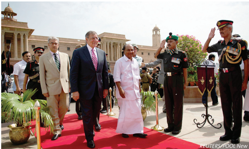
US Defense Secretary Leon Panetta and India's Defence Minister A.K. Antony in New Delhi, 6 June 2012

Relations between India and the United States have improved significantly during the past decade. Growing defence trade and military exchanges, plus civilian commerce and sustained efforts to address each other's concerns, have helped reduce mutual suspicions which date back to the Cold War. However, the different geostrategic positions of the two countries and diverging policy priorities will continue to allow for selective cooperation only. India is bound to remain a gap in the US strategic pivot towards Asia.