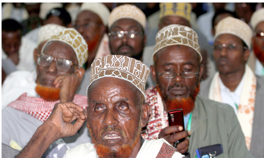
Delegates of the constituent assembly meet in Mogadishu, 25 July 2012.

The upcoming presidential election and establishment of a new government should mark the official end to Somalia's transition period. It will not, however, mean an end to Somalia's conflict and chronic humanitarian crises. The transition has been marked by the same challenges as previous peace processes and has failed to address the deep-rooted causes of the conflict. External involvement, driven by various agendas, has resulted in a rushed process. Peace is unlikely to come from such a top-down approach and may rather lie in a bottom-up approach that builds on the elements of Somalia that are working.