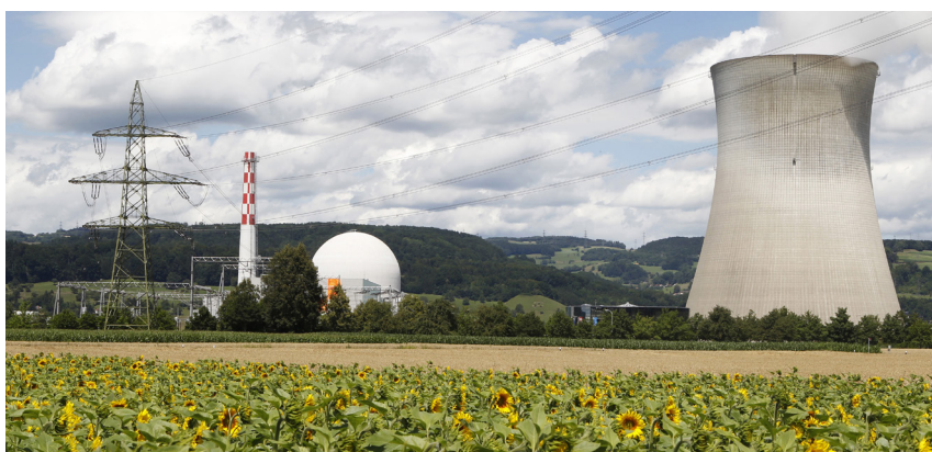
Leibstadt nuclear power plant, 9 July 2012.

The decision to phase out nuclear energy is of strategic importance for Switzerland. Providing a clean, economic, and climate-friendly supply of energy is a major political and societal challenge. A number of ongoing developments in Europe pose further obstacles to a transformation of Switzerland's energy supply. If the Federal Council's "Energy Strategy 2050" is to be implemented successfully, a consensus on burden-sharing must be reached.