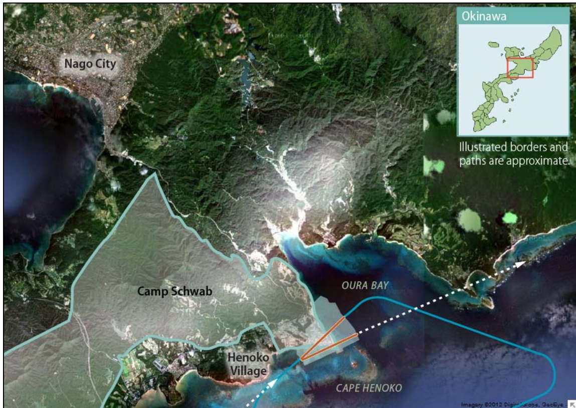
Figure 3. Location of Proposed Futenma Replacement Facility