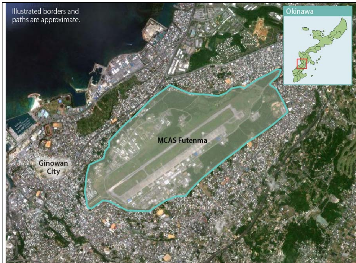
Figure 4. MCAS Futenma

The base is located within a dense urban area, surrounded by schools and other facilities that are subjected to the high noise levels that accompany an active military training site. (See Figure 4 .) A new equipment accident or serious crime committed by a U.S. servicemember could galvanize further Okinawan opposition to the U.S. military presence on the island. The risks are heightened by the anticipated increase in activity as units that have been deployed to conflicts in the Middle East return to Okinawa. Despite the April 2012 agreement to move about 9,000 Marines off Okinawa, the absolute number of personnel and aircraft is expected to rise at Futenma and other facilities in the near term.