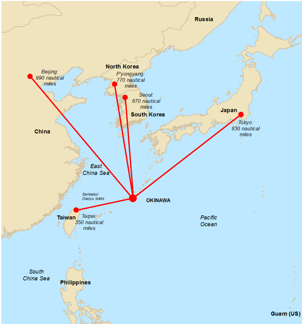
Figure 2. Okinawa's Strategic Location