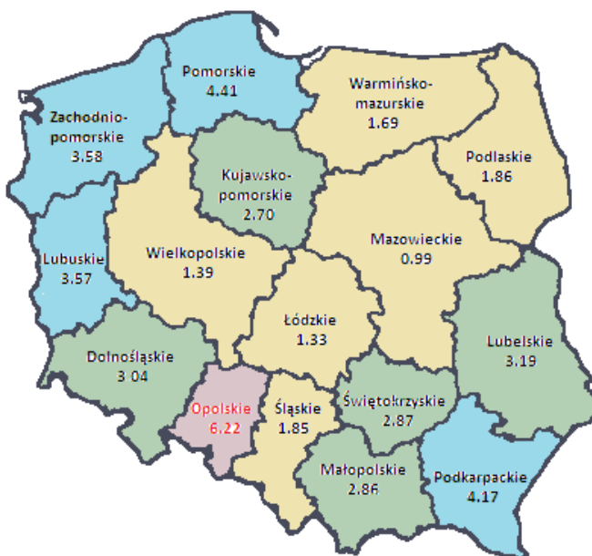
Figure 3 - Distribution of Remittances by Region (Percent of households)

Secondly, recipients of remittances are mostly from small towns and rural areas rather than large cities; they are less present in the central regions of the country, which have experienced a lower outflow of migration (Fig. 3). In addition, they are often from large households (especially young families with children), and their educational levels reach basic vocational education or higher (rather than primary education). Interestingly, these families also receive lower-than-average social benefits from domestic sources, most likely reflecting the specific demographic characteristics of these families, such as age and number of persons included in the household.