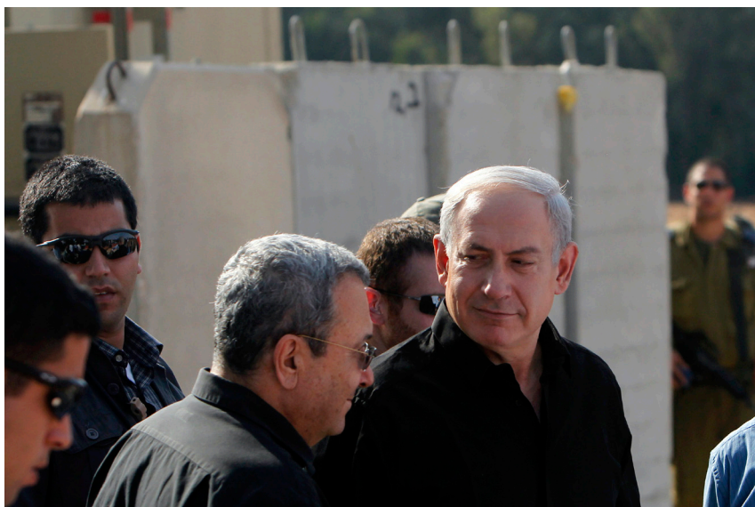
Israel's PM Netanyahu and Defence Minister Barak visit an Iron Dome rocket shield command centre, 24 October 2012.

The reaction to the Arab revolts that began in 2011 was more sceptical in Israel than in other countries. This is because most Jewish Israelis agree that the net effect of the fundamental changes in the Arab world will be negative for Israel's security. What Israelis do not agree about, however, is how the country should best respond to these changes. While there are those who argue that Israel should engage with its neighbourhood in order to lessen its toxic image in the Arab world, many Israelis take the more hawkish view that the country should retreat and focus on enhancing its military capacity to counter future threats.