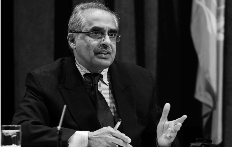
Vijay Nambiar (UN Photo/Paulo Filgueiras).

meeting of heads of UN agencies to develop a common platform for “system-wide engagement on socio-economic and development issues,” consistent with the three-pillar approach. 3 A later request to visit Myanmar in August was rejected by the government.