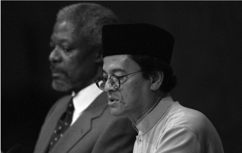
Secretary-General Kofi Annan and Razali Ismail.