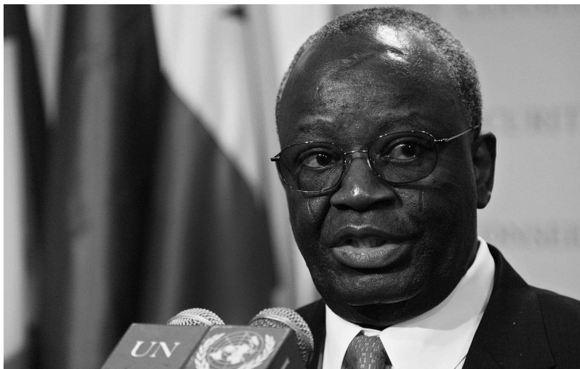
Ibrahim Gambari.

Myanmar context than the previous envoy. Also important for the protocol-conscious Myanmar leadership was that, as Under-Secretary-General, Gambari had a higher rank than any of the previous envoys.