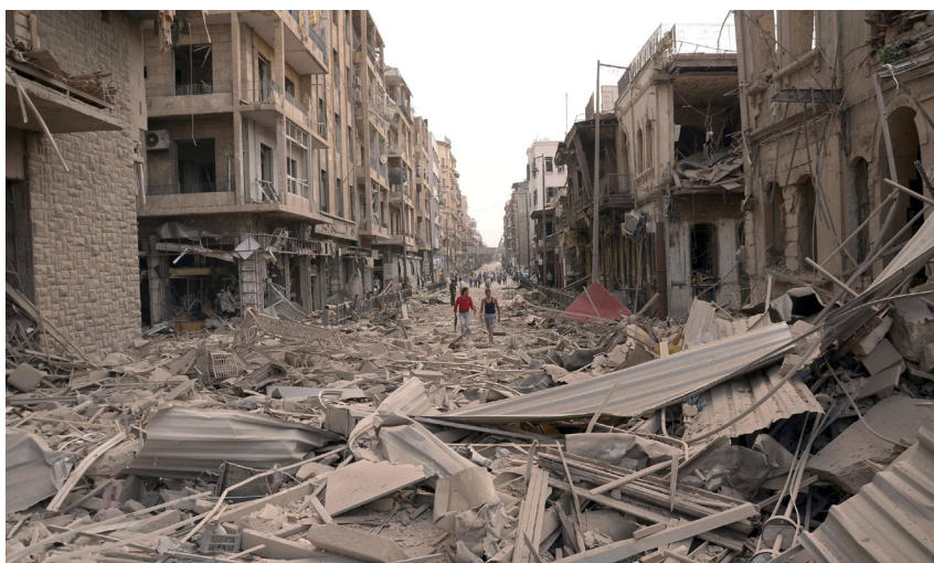
War-ravaged street in Aleppo, 3 October 2012.

The chances of a negotiated solution for the civil war in Syria are smaller than ever. A further escalation of violence is to be expected, though not all scenarios suggest an extended war of attrition. For the time being, no Western military intervention is in the offing, due to the divisions in the UN and the high risks of such a mission. However, the Syrian conflict is increasingly developing into a regional proxy war, the outcome of which will have far-reaching consequences for the balance of power in the Middle East.