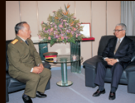
General Chi Haotian, Chinese Defence Minister and Vice Chairman of China Central Military Commission, and State Councillor, calls on Deputy Prime Minister and Defence Minister Dr Tony Tan

The US-Singapore defence relationship is an important one. Exercises with the US Armed Forces have been steadily growing in scope and complexity, with more US assets being deployed for the bilateral exercises. In 1998, the Singapore and US governments signed an Addendum to the 1990 Memorandum of Understanding which will allow US Navy ships and aircraft carriers to berth at Changi Naval Base when the base is ready.