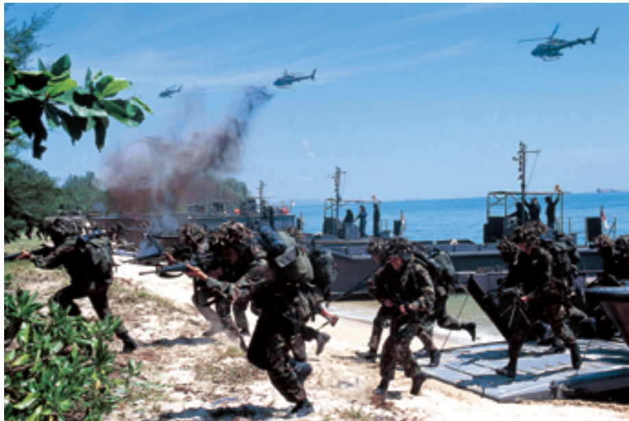
Fighting as one

Today, the Joint Staff drives the integration of the SAF and brings the Services together to meet the goal of enhancing the SAF's capabilities as a whole. The Joint Staff sets priorities and apportions limited manpower and financial resources. When new capabilities are developed, the Joint Staff ensures that these capabilities fit well into the overall fighting system. In operations planning, it optimises the combination of capabilities and resources from the three Services to achieve the mission. The Joint Staff plays the pivotal role to facilitate the Services working together and to provide the direction for new initiatives for the SAF.