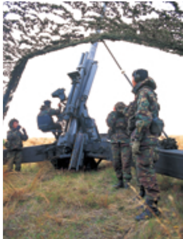
FH2000 training in New Zealand

The rising educational standards among our National Servicemen have enabled the SAF to leverage on technology as a force multiplier. In other words, we use technology to do more with fewer people. One example is the FH-2000 155mm self-propelled howitzer gun. It delivers higher firepower and longer range but uses a crew of 8 instead of the 12 for the gun it replaced. Similarly, the new Endurance Class LST is 40% larger and twice as fast as its predecessor, but operates with only half the crew of the ex-County Class LST.