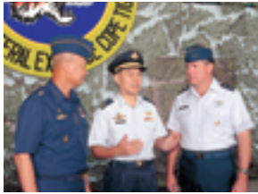
The opening of Ex Cope Tiger, an exercise between the RSAF, USAF and the Royal Thai Air Force

The SAF enjoys close and friendly ties with many of the armed forces of ASEAN countries. These bilateral relationships have been steadily growing in scope and depth. For the future, it will remain a priority for Singapore to develop and strengthen its defence ties with all ASEAN members to realise the common vision of a cohesive and strong ASEAN.