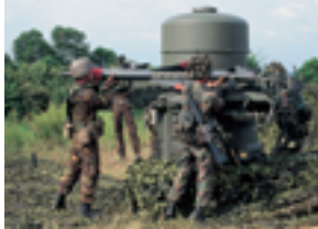
RSAF and Royal Brunei Air Force troops in Ex Air Guard

The SAF enjoys close and friendly ties with many of the armed forces of ASEAN countries. These bilateral relationships have been steadily growing in scope and depth. For the future, it will remain a priority for Singapore to develop and strengthen its defence ties with all ASEAN members to realise the common vision of a cohesive and strong ASEAN.