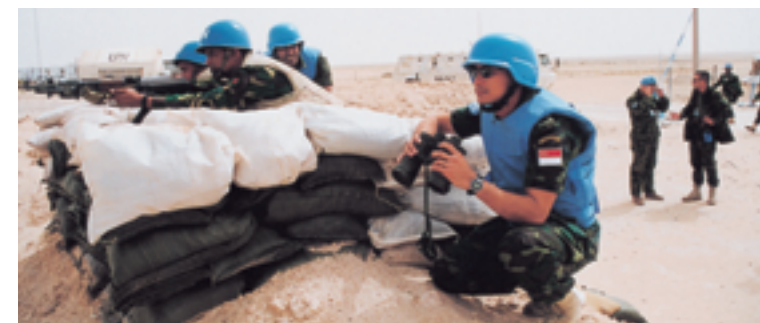
SAF military observers in UNIKOM (Kuwait)

Singapore first participated in UN peacekeeping operations in 1989 and has contributed small contingents over the years. Over a decade, we have contributed a cumulative total of over 800 personnel to UN missions, including peacekeeping, peacemaking and arms inspection missions. Although the SAF is constrained by being a largely conscript armed forces with a small pool of regulars, it will continue to play its part by supporting peacekeeping operations to the best of its ability.