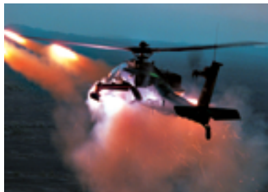
AH-64 Apache attack helicopter

• Manoeuvre. The Army can project force rapidly. On land, the new Singapore-made Bionix Infantry Fighting Vehicles (IFVs) together with the upgraded M-113 Armoured Personnel Carriers enable the Army to concentrate forces swiftly where required, with armour protection and substantial firepower. The helicopters operated by the RSAF, and Fast Craft operated by the RSN, allow the Army to exploit both the air and sea dimensions, to deploy, insert and re-deploy forces rapidly.