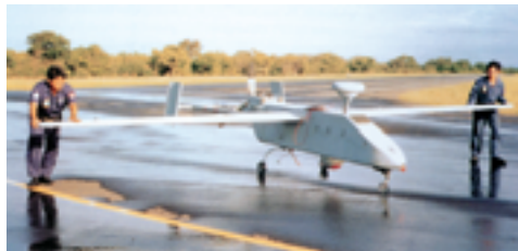
Leveraging on unmanned technology

Stealth Technology. The SAF can use stealth technology and advances in low observable technology to reduce the signature of its forces and the likelihood of detection. Our new platforms – ships, aircraft and land vehicles – will incorporate more stealth technology to enhance their protection.