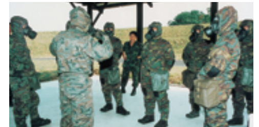
Building-up capability for chemical defence

Having at hand a wide range of capabilities and options for mounting different responses to low-intensity threats provides only part of the solution. The other part lies in the SAF working seamlessly with agencies from other Ministries to deal effectively with such threats. A key priority for the SAF in the future will therefore be to strengthen its linkages with the other Ministries. This is yet another dimension of Total Defence, which will take on greater significance in the years ahead.