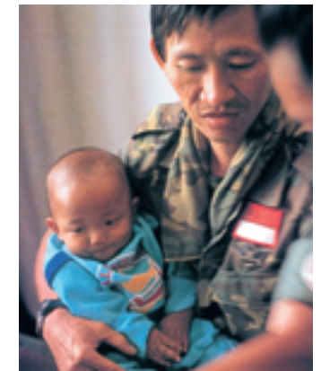
An SAF medical orderly attending to a baby after the 1990 Philippines earthquake

Singapore's well-being and survival are best served by a world order based on the principles of co-operation and consultation, rather than the use of force. We therefore regard the United Nations as a key institution for maintaining the international law and order necessary for a global climate of stability. The SAF will continue our efforts to support the United Nations' work.