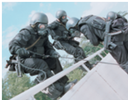
Dealing with terrorist threats

The threat of terrorist and other forms of subversion cannot be ignored in the years ahead. Terrorist groups, whether acting for their own specific objectives or to serve the interests of states, will increasingly have better access to modern technology and weapons, including unconventional means.