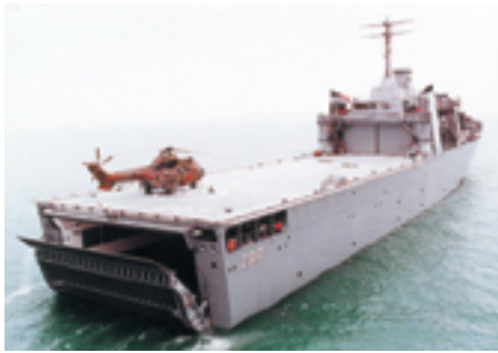
Endurance class LSTs

3 rd Flotilla is the supply and transportation arm. It operates a range of specialised vessels, including LSTs, Fast Craft for Equipment and Personnel (FCEPs), and Ramp Power Launches (RPL). These provide fast and efficient movement of troops to and from training areas in Singapore and overseas. Some of them have also