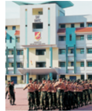
The new BMTC at Tekong

The SAF works closely with other national agencies to identify commercially less valuable areas to locate its military camps. Often, this puts the camps closer to training areas, thereby reducing transportation time for troops to move from camp to training ground. The development of the Basic Military Training Centre (BMTC) and the School of Infantry Specialists (SISPEC) complexes in Pulau Tekong is a good example of this. New camp designs also make more intensive use of land. Offices and sleeping quarters are housed in multi-storey buildings. Units in the same command are co-located in camp complexes for better operational efficiency. This allows common facilities and services to be shared, resulting in more savings.