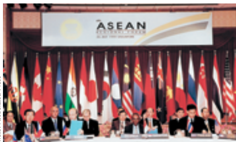
ARF in session

At the multilateral level we welcome the strengthening of existing multilateral security arrangements, such as the Five Power Defence Arrangements (FPDA). Singapore is fully committed to the FPDA, which is the longest standing multilateral arrangement in the region. This arrangement provides for the defence of Malaysia and Singapore, which is indivisible. Since its formation in 1971, the FPDA has become a unique component of the region's security architecture and contributes to regional peace and stability. Its importance and relevance remain undiminished despite the many changes in the geopolitical landscape over the years.