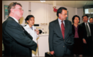
Laboratory tour of DSO Centre for Chemical Defence during OPCW Director-General's visit

Singapore has built up a strong capability to defend our population against chemical threats. Today, our DSO Centre for Chemical Defence is among a small number of laboratories being considered by the Organisation for Prohibition of Chemical Warfare (OPCW) for international analytical accreditation. Collaboration projects with Swedish and French defence research establishments contributed significantly to building up our expertise.