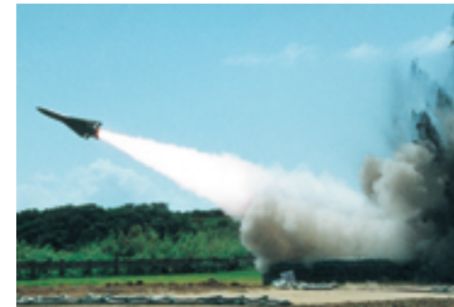
Air defence weapons

For air defence operations, the RSAF is also equipped with a wide range of surface-to-air weapons of various types: