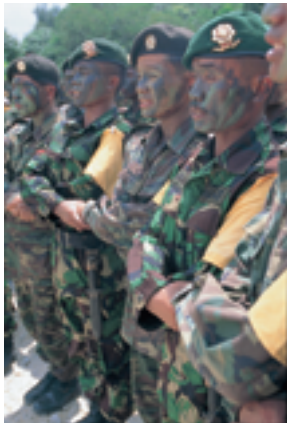
Bilateral exercises such as the SAF-TNI SAFKAR INDO PURA help forge friendships

Singapore has also developed good bilateral defence relations with many other countries in the wider Asia-Pacific region, including the US, China, Japan, South Korea, Australia, New Zealand, India and Bangladesh.