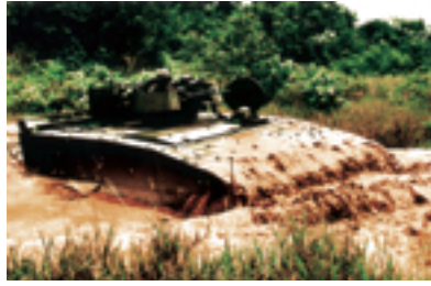
BIONIX IFV – better speed, firepower and protection

The Army's combat power is organised around three key capabilities: