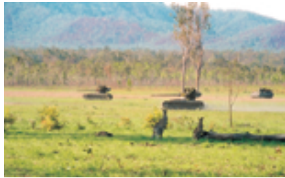
Training in Australia

The SAF has been looking for opportunities for training in friendly countries since the 1970s. Today, the SAF trains in many countries, including Thailand, Brunei, Indonesia, Australia, New Zealand, France, Sweden, South Africa, Canada, and the United States.