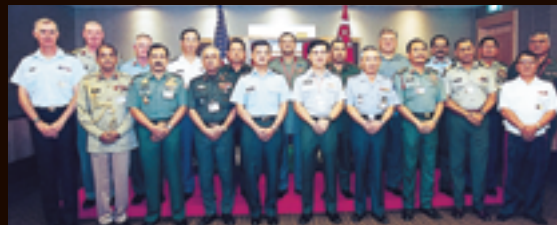
Singapore and the US co-host the 1st PACC

In February 2000, the RSAF hosted the Millennium Air Power Conference in Singapore. The conference provided a platform for air force chiefs from around the world to discuss developments in air power concepts and technology in this new millennium.