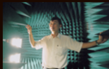
Anechoic chamber is used to check the performance of radar systems

“The SAF depends on the ingenuity and innovativeness of DSO engineers because electronic warfare is regarded as a secret art that no country wants to share. At best, overseas suppliers are prepared to sell us black boxes.”