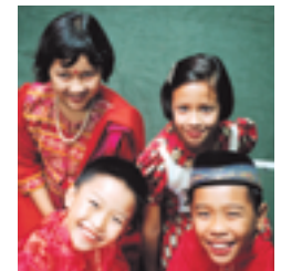
A World-Class Home

From a small fishing village, Singapore has developed into the thriving global city-state of today. In the 21 st Century, we hope to build for our children and ourselves a First World Economy and a World-Class Home. This vision can only be realised if Singapore is safe and secure, in a region that is peaceful and stable.