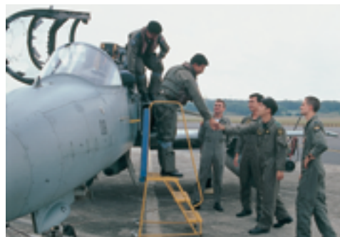
FPDA members conduct regular air defence exercises as part of the Integrated Air Defence System

However, bilateral arrangements alone are not adequate to enhance regional peace. Just as the Asian financial crisis highlighted the need for international co-operation to enhance stability in the global financial system, greater security co-operation is vital for regional and global peace and stability in the 21st Century. Multilateral