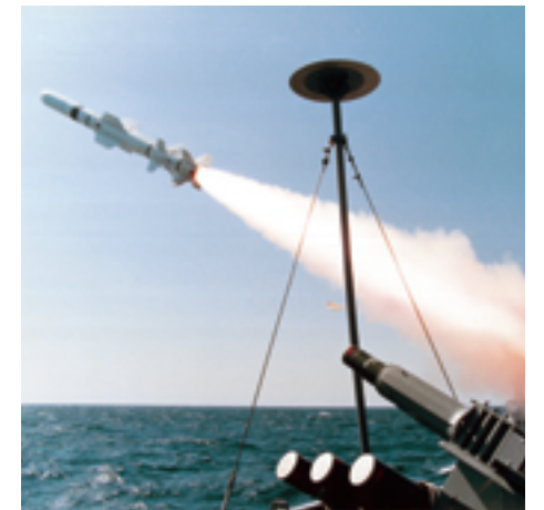
Harpoon live firing

The RSN has sailed far and wide to exercise with friendly navies. Such exercises enhance friendship and understanding, and also allow the RSN to benchmark itself against some of the most advanced navies of the world. The RSN participates in the FPDA's annual maritime exercise in the South China Sea with its four FPDA partners. Bilateral anti-submarine exercises are conducted with the Indian Navy's submarines in the Indian Ocean, and with Australian and US submarines off local waters. The RSN also carries out regular Harpoon missile live-firing exercises with the US 7 th Fleet in the Pacific Ocean to hone its surface strike capability.