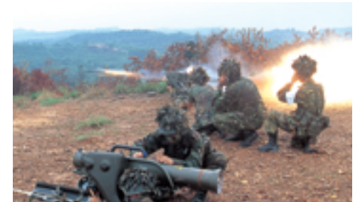
Training as in war

Organising and Training Just as in War. The SAF organises and trains exactly as it would fight in an operational scenario.