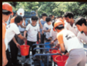
An emergency water-rationing exercise

Over the years, steps have been taken to strengthen Total Defence. There are public emergency exercises, training of civil defence volunteers, and setting up of civil defence grassroots organisations. A more recent initiative was the National Education programme. Launched in September 1996, National Education aims to enhance the commitment of Singaporeans to our nation, i.e., the nation's "heartware" and social cohesion, so that Singaporeans stand united amidst the diversity of a multi-cultural and multi-ethnic nation.