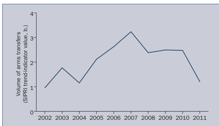
Figure 1. SIPRI's estimate of Germany's arms exports, 2002–11

The major recipients of German arms exports in 2011 were Brunei Darussalam (accounting for 16 per cent of exports), USA (11 per cent), Singapore (7 per cent), Spain (7 per cent) and Taiwan (6 per cent). Tanks and armoured vehicles represented 26 per cent of the volume of German major conventional weapons exports in 2011, with ships accounting for 22 per cent, engines 20 per cent, and missiles 15 per cent. (See box 2 for some examples of the TIV of German arms exports in 2011.)