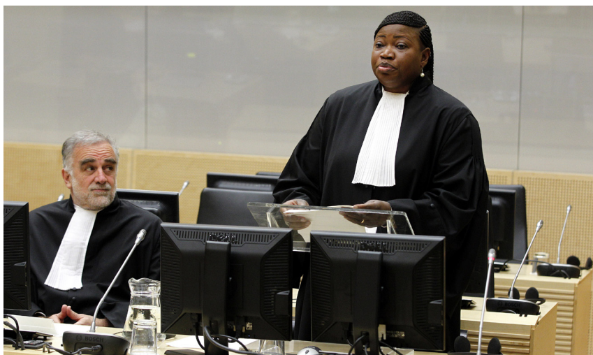
Passing on the baton at the ICC: Fatou Bensouda (Gambia) took over as chief prosecutor from Luis Moreno Ocampo (Argentina) on 15 June 2012.

After a decade of work, the International Criminal Court (ICC) has developed into an established institution of international criminal justice. Structural, legal, and political challenges remain, however: The gaps in membership are a problem, the focus on Africa has been criticised, and the relationship between justice and peace is a source of tension. Despite these difficulties, the ICC also has a preventive effect.