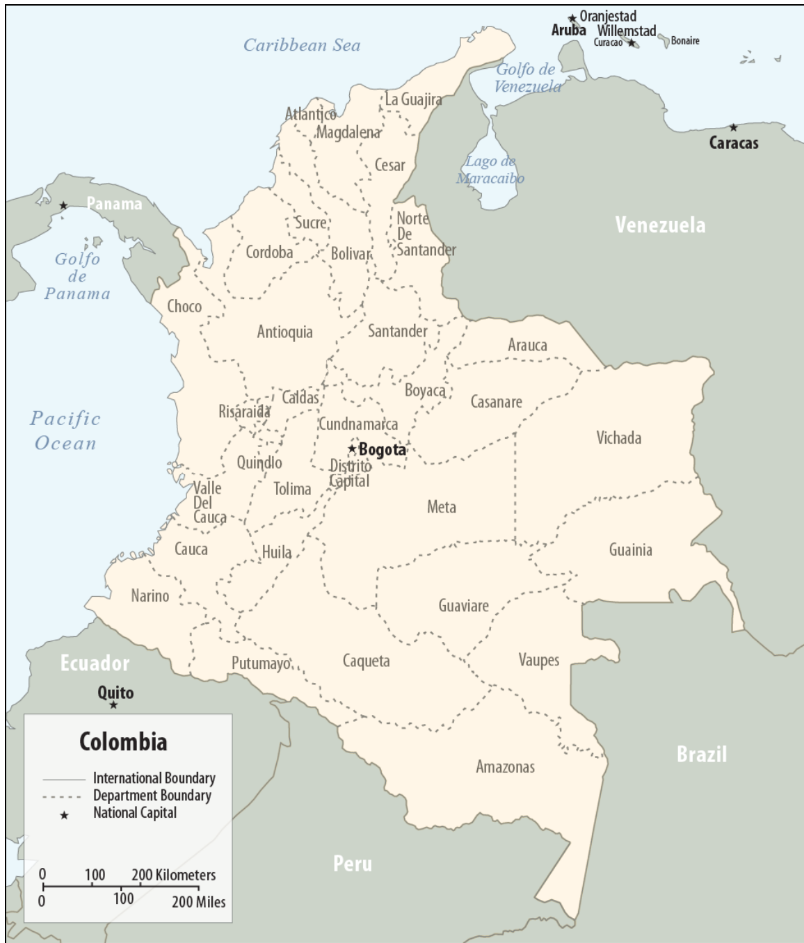
Figure I. Map of Colombia Showing Departments and Capital