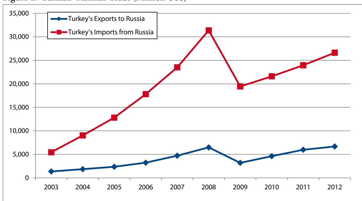
Figure 1: Turkish–Russian Trade (Million US$)