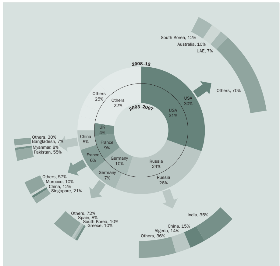
Figure 2. The five largest exporters of major conventional weapons, 2003–2007 and 2008–12, and their main recipient states, 2008–12

The volume of Chinese exports of major conventional weapons rose