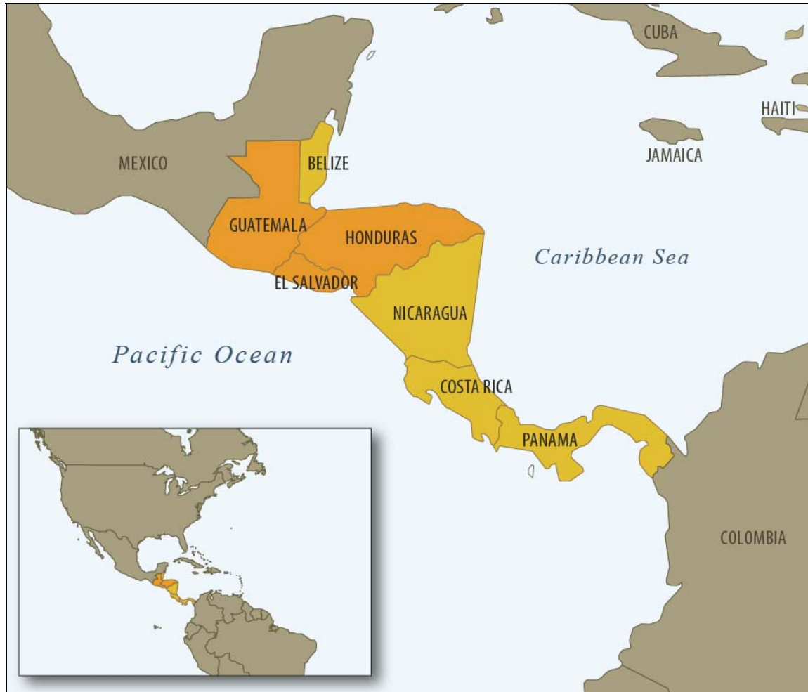
Figure I. Map of Central America