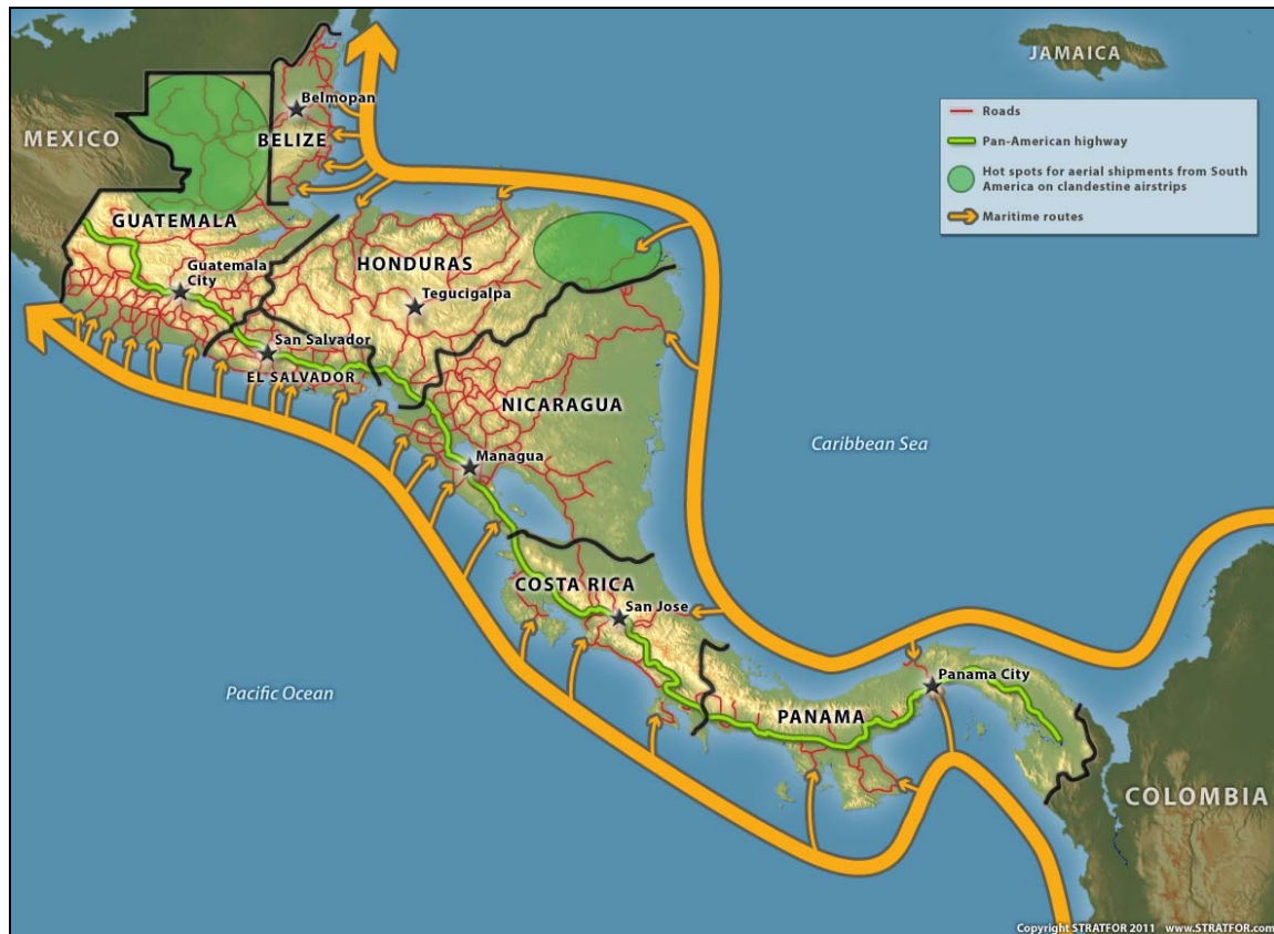
Figure 3. Central American Drug Trafficking Routes