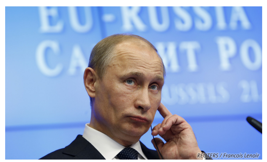
Tense relations: Vladimir Putin at the EU-Russia Summit in Brussels, 21 December 2012

While the economic importance of Russia in Europe has increased over the past years, political relations have deteriorated. Russia under Putin is once more pursuing great power ambitions and is increasingly asserting interests and values that differ from those of the West. Those hoping for a post-imperial and democratic Russian identity have largely been disabused. Europe and the US should try to maintain their own interests through a combination of cooperation and strategic competition.