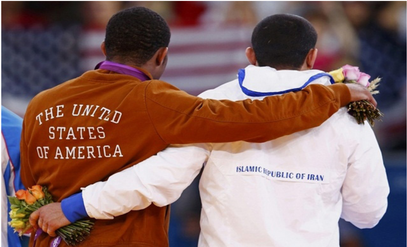
American and Iranian wrestlers celebrate victory together at the 2012 London Olympic Games.