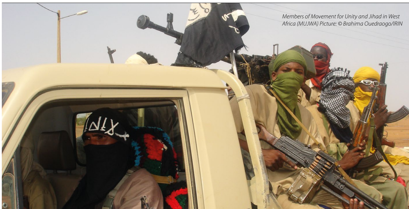
Members of Movement for Unity and Jihad in West Africa (MUJWA)

evaluate their human and material resources. It does seem clear, however, that the two largest of these organisations, Ansar al-Dine and MUJWA, have benefitted from the resources related to trafficking and hostage taking, the hasty departure of the Malian armed forces and the administration and support provided by AQIM.