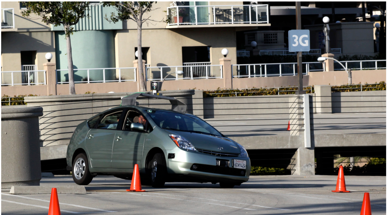
Google's driverless car races around a test track.

that is, from the global scale down to the individual. It will present new opportunities for governments, businesses, citizens, and organizations. Big data could be used to help solve or manage critical global problems, lead to new scientific breakthroughs and advances in human health, provide real-time information and analysis on wide areas of life, wire up the planet's natural systems for monitoring and environmental remediation, greatly improve efficiency and resource use, and enhance the decision-making and daily operations of society.