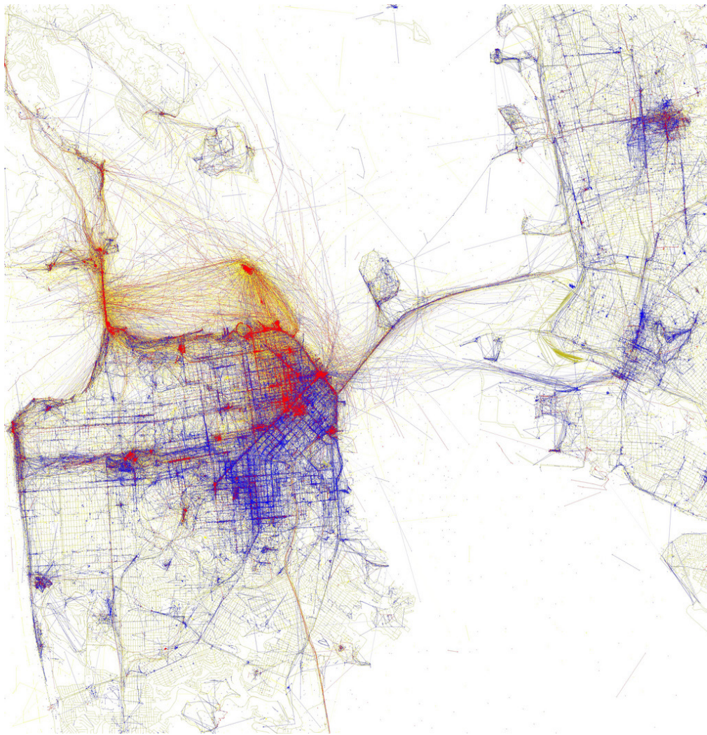
Flickr user Eric Fischer used geotagging data to map popular tourist and local hotspots around San Francisco.

analyzed in the cloud and the results returned to the individual or their physician on their smartphone. There are also estimates that use of big data could reduce healthcare errors, including a 30 to 40 percent improvement in diagnoses, and lead to a potential 30 percent reduction in healthcare costs. Agriculture is another area that is being enhanced by sensors and big data. McKinsey notes that “precision farming equipment with wireless links to data collected from remote satellites and ground sensors can take into account crop conditions and adjust the way each individual part of a field is farmed—for instance, by spreading extra fertilizer on areas that need more nutrients.” 16