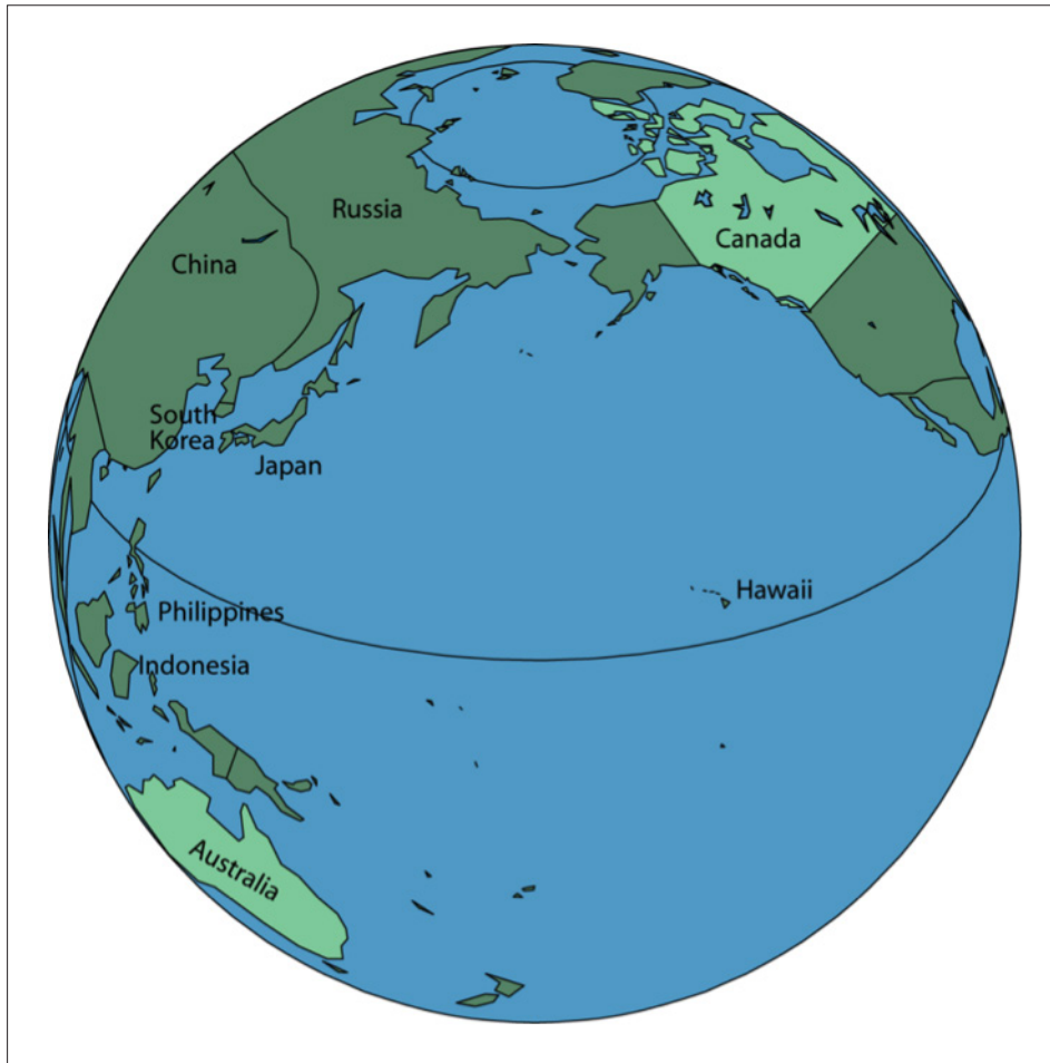
Figure 1: The Pacific Rim