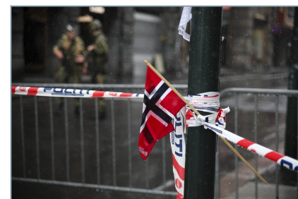
A Norwegian flag tied to a lamp post in Oslo following the 22 July 2011 car bomb (Oterhals/Flickr)

Norway's military involvement in Afghanistan and Libya, the indictment of the radical cleric Mullah Krekar on terror charges, or the printing of cartoons depicting the Prophet Muhammad in a Norwegian newspaper.