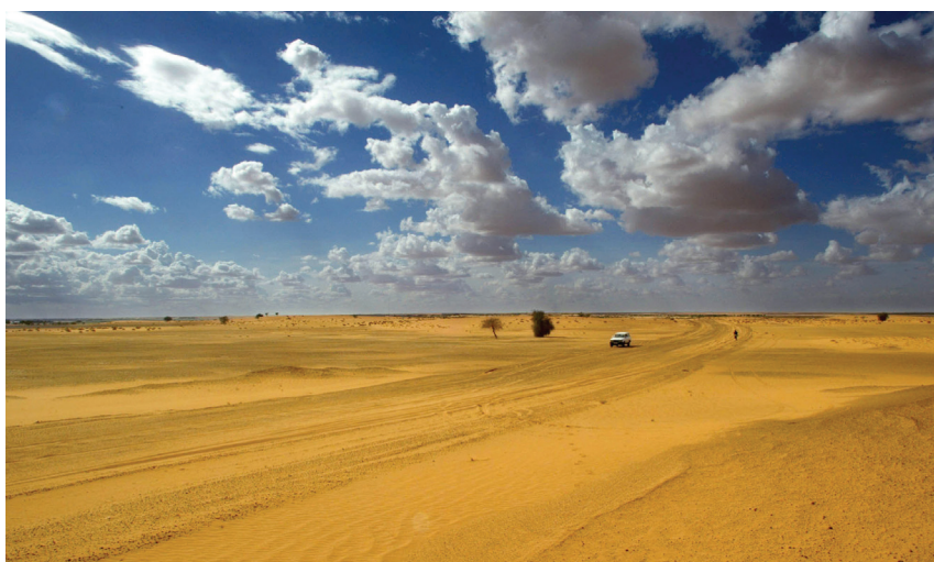
Tourists at the border of the Sarah dessert in Forgo in Northern Mali.

In recent years, the number of Kidnappings for Ransom (KFR) has increased globally. Especially for Islamist terrorist groups in the Sahel, kidnapping has become a lucrative source of income. Switzerland is engaged on the frontline of the struggle to establish a consistent code of conduct in handling cases of KFR, which will also be an issue in 2014 when Switzerland will chair the Organisation for Security and Cooperation (OSCE).