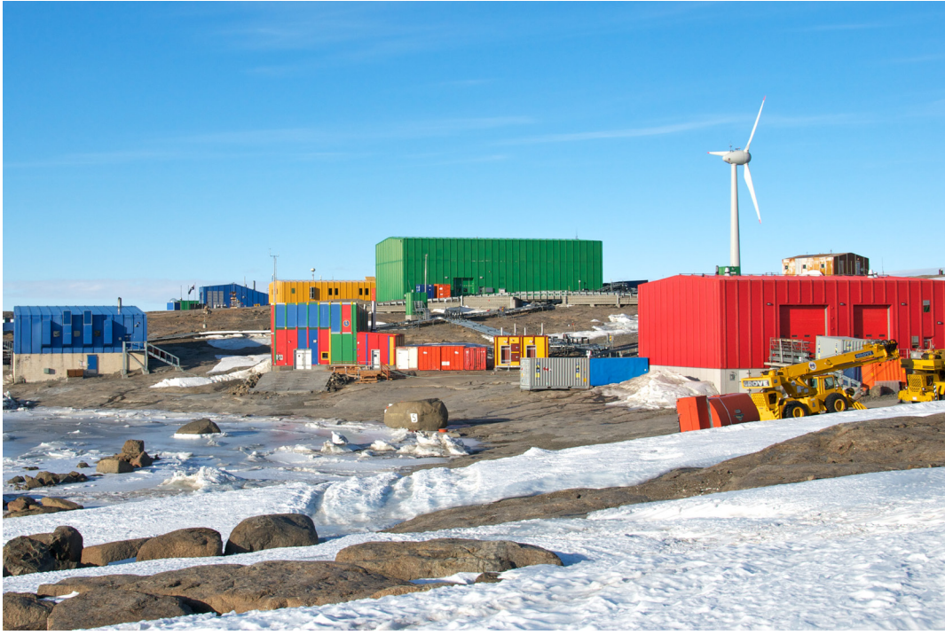
IA30556 Mawson Research Station © G Jacobsen, courtesy of the Australian Antarctic Division.

As in the past, challenges will arise from within and outside the ATS. The challenges may be partly symbolic—treaty parties can expect ongoing and closer scrutiny of their actions by non-government groups and can be expected to press for more open access to the Antarctic Treaty Consultative Meeting and for a broadening of observer status within the system. More substantive pressures