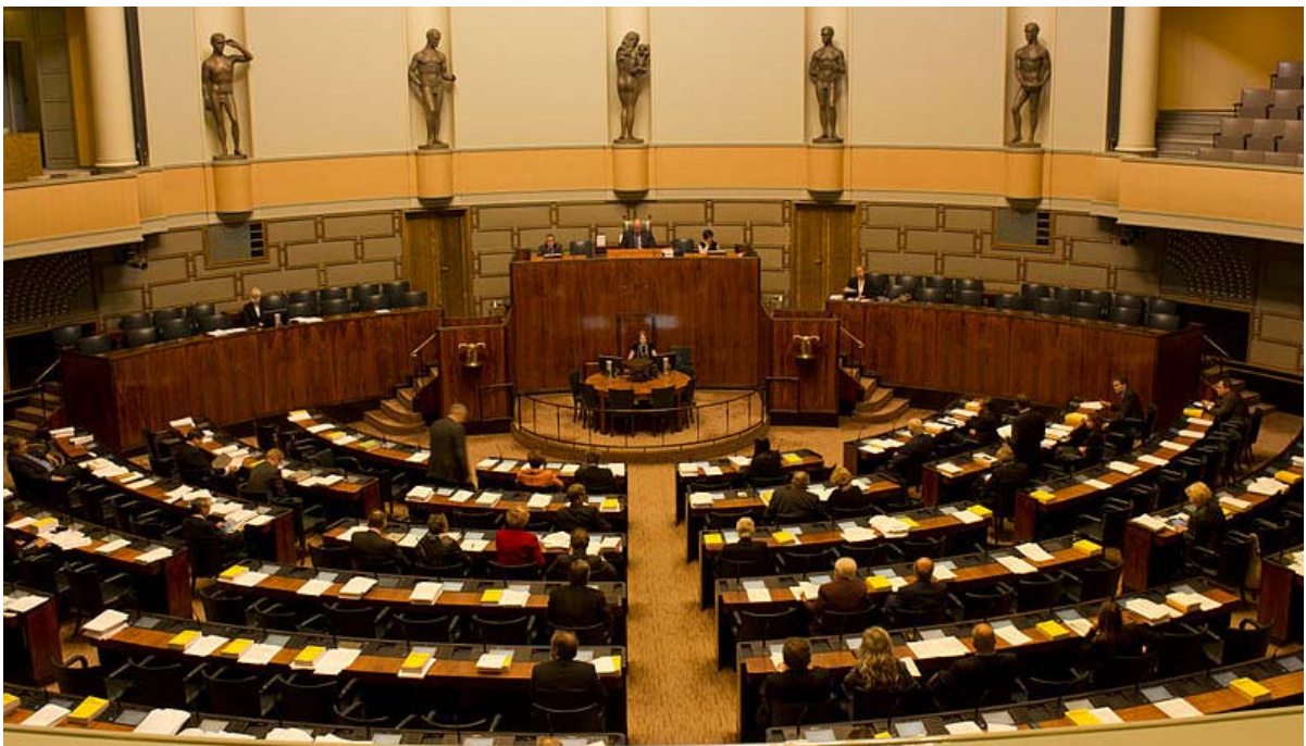
Session Hall of Parliament of Finland