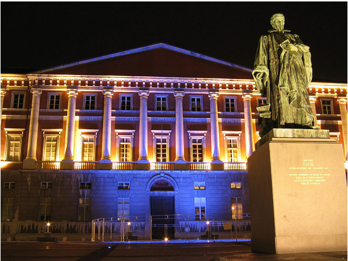
© Guillaume Bulet, Courthouse of Chambéry, France