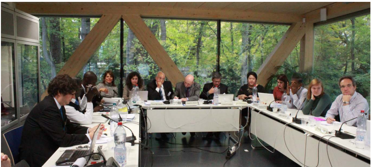
during the Expert Meeting at Centre Jean-Jacques Gautier in Geneva