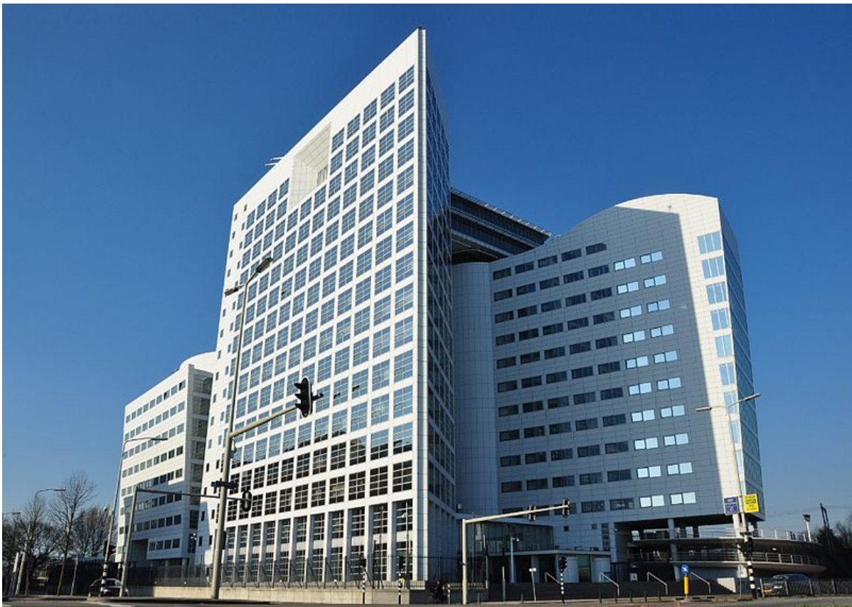
International Criminal Court, The Hague, Netherlands