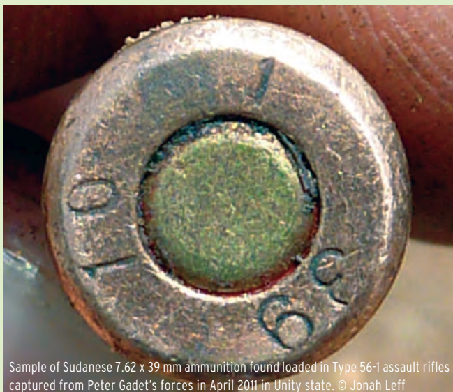
Sample of Sudanese 7.62 x 39 mm ammunition found loaded in Type 56-1 assault rifles captured from Peter Gadet's forces in April 2011 in Unity state.

Sudanese and Chinese ammunition. There are dozens of varieties of 7.62 x 39 mm ammunition (for AK-pattern assault rifles) circulating in Sudan and South Sudan. However, the Small Arms Survey has identified a few makes that are particularly prolific among Southern insurgents. The two most common producers of observed 7.62 x 39 mm ammunition with militia in South Sudan are Sudan and China. In particular, the Survey has observed thousands of rounds of Sudanese manufactured 7.62 x 39 mm ammunition with the headstamp '1_39_10' (see photo), with '1' likely denoting the batch number, '39' representing the case length, and '10' the year of production. This variety of ammunition was uniformly contained in more than 150 Type 56-1 assault rifles that the SPLA captured from the SSLM/A (Gadet) in April 2011, and was present among equipment the SPLA captured from George Athor earlier the same year. The following