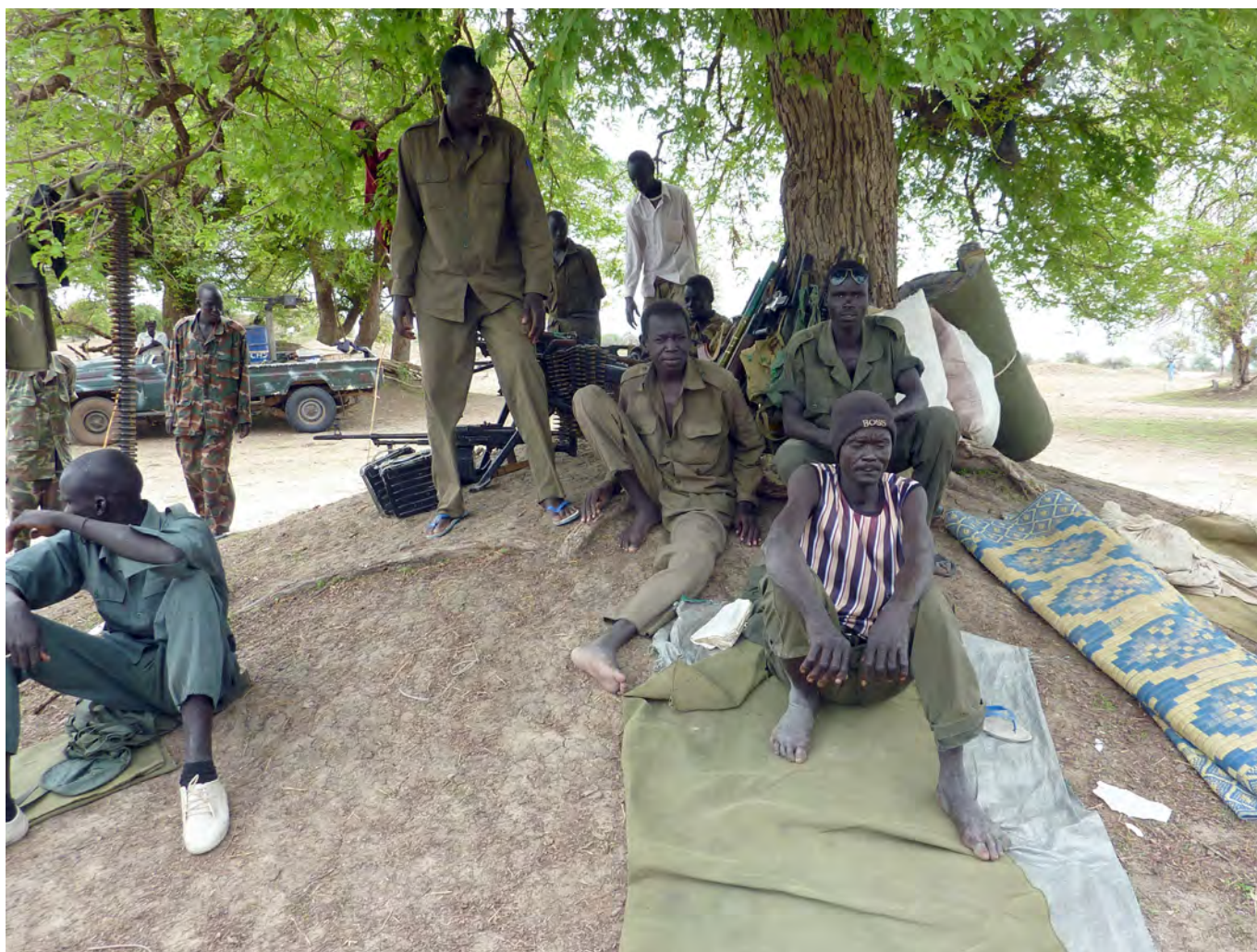
SSM/A fighters awaiting integration in Mayom, Unity, 9 May 2013.

In response, throughout 2012, the SPLA strengthened its military presence along its border with Sudan. Their responsiveness to attacks from the Southern insurgents in Sudan increased, and according to the SPLA commanders in Upper Nile and Unity, they were