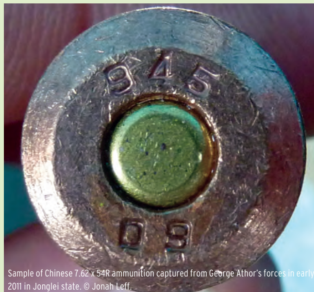
Sample of Chinese 7.62 x 54R ammunition captured from George Athor's forces in early 2011 in Jonglei state.

year, SSDF forces under the leadership of John Duit handed over identical rounds after crossing into South Sudan from Blue Nile. The Small Arms Survey has observed similar varieties of 7.62 x 39 mm ammunition with different batch numbers and production years with other Southern militias as well as among weapons that the SPLM-North (SPLM-N) captured from SAF in South Kordofan and Blue Nile.