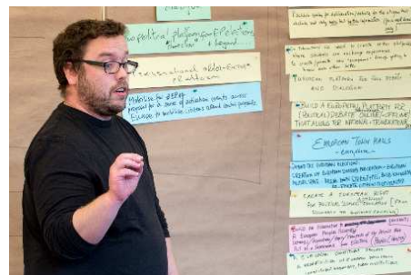
“BUILD KNOWLEDGE, RE-EDUCATE CITIZENS TO CITIZENSHIP”

Whilst the EU has to some extent always been perceived as distant and far-removed from the realities of its Member States, the crisis has contributed enormously to discrediting the Union as a democratic, representative and legitimate source of political power. This perceived democratic deficit is the consequence of the lack of adequate spaces for transnational deliberation and debate, obstructing the exchange of information and experience and ultimately undermining the creation of any form of discernible European community.