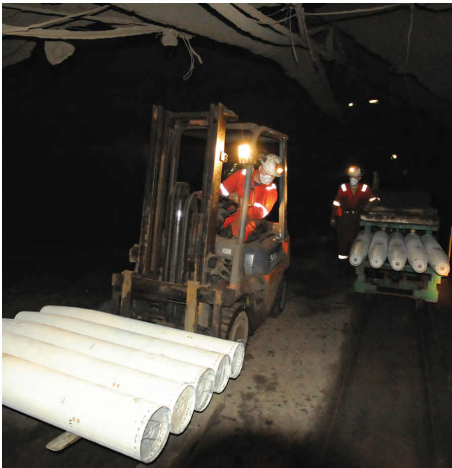
Warheads are transported to be detonated in controlled explosions in a dedicated facility 800 m below ground, Lökken Verk, Norway, 2012.