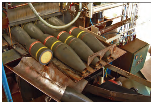
Photo (right): The saw-cutting of high-explosive projectiles to expose their energetic content, after which the components travel on a conveyor belt to the next station to melt out the explosives, Lübben, Germany, 2012. © Sprewerk Lübben GmbH