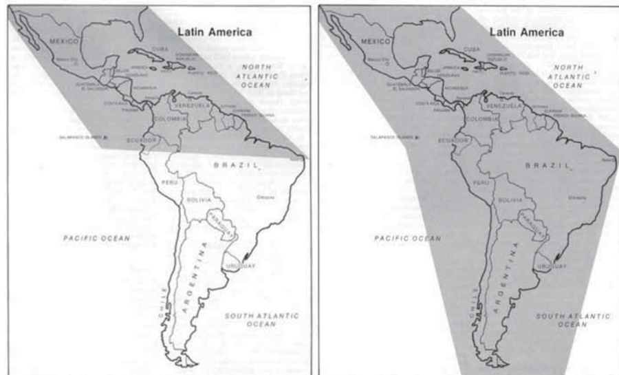
FIGURE 2. QUARTER-SPHERE AND HEMISPHERE DEFENSIVE PERIMETERS 32

A second group of policymakers and planners advocated a strategy of true “hemispheric defense” according to which the United States would commit to denying the enemy access to the entire hemisphere, including all of Latin America. Defending this extensive perimeter would require enlisting the active participation of the Latin American states (as well as Canada). Although the defense of the entire hemisphere would require additional resources, its proponents thought it essential to build the psychological solidarity needed to keep the region together in a protracted war. 33 Accordingly, the Joint Planning Board began drawing up RAINBOW 4, which called for the United States to defend the entire hemisphere by deploying U.S. forces as far afield as the Southern Cone of South America. 34