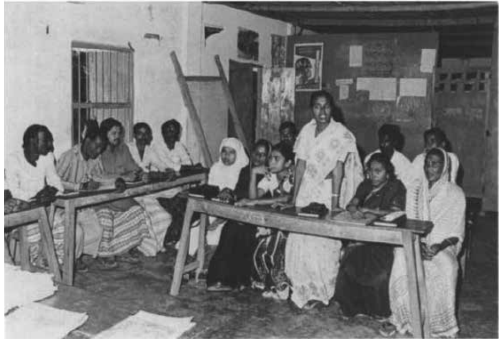
Photo discussion exercise – Observations from a gender perspective