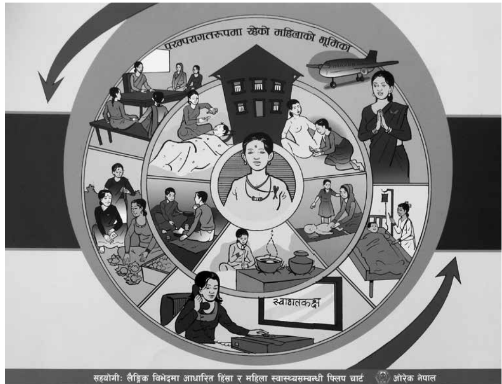
Social roles traditionally ascribed to women.