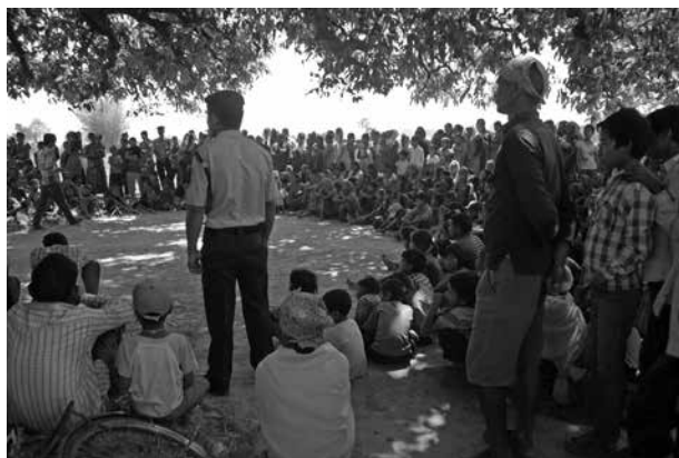
Photo discussion activity: Gender-sensitive community safety achievements