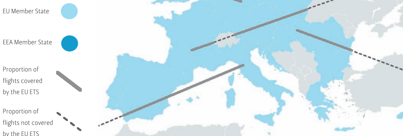
Figure 1. Revised scope of the EU ETS Directive vis-à-vis emissions from international aviation. Airspace approach, Commission proposal.

contains an element of differentiation, as countries with less than 1 per cent of global air traffic – in practice, most small and medium-sized developing countries – are exempted to accommodate the special circumstances of developing countries.