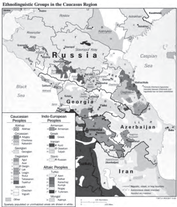
Map 1. North Caucasus Ethnic Divisions. 10

from roughly the 8th to the 12th centuries. Chechens were much later, adopting Islam during the 15th and 16th centuries, while the nations of the Western part of the North Caucasus finally did so 2 centuries later. 9 Meanwhile, their southern neighbors Georgia and Armenia continued to follow the Christian Orthodox tradition, each having its own autocephalous Church. For an illustration of ethnic divisions in North Caucasus, see Map 1.