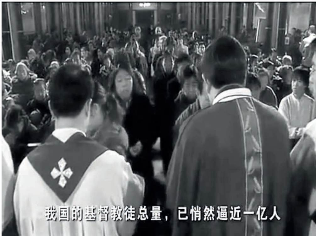
“Sadly, there are now almost 100 million followers of Christianity in our country.” Screenshot from the video Jiaoliang Wusheng.

During his recent European tour, Xi is also reported to have said that China has in the past tried all the different political systems, including multi-party democracy, but all except socialism have failed to serve China’s interests. Timothy Garton Ash aptly remarked in The Guardian that Xi’s goal is “to turn China into an advanced economy and three-dimensional superpower, drawing on the energies of capitalism, patriotism and Chinese traditions, yet all still under the control of what remains, at its core, a Leninist party-state”. 6