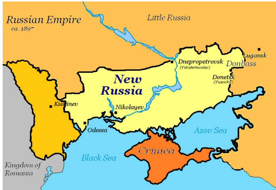
Map Credit: Dim Grits

If all of these provinces are either annexed by Russia or form a nominally independent federation of 'Greater Novorossiya', the population of Ukraine would drop from 46 million to 25 million. This would not only subtract nearly 45% of Ukraine's 2013 population but also roughly two thirds of its GDP, given that the country's eastern and southern provinces are far more industrialized than those of the center and west. 2