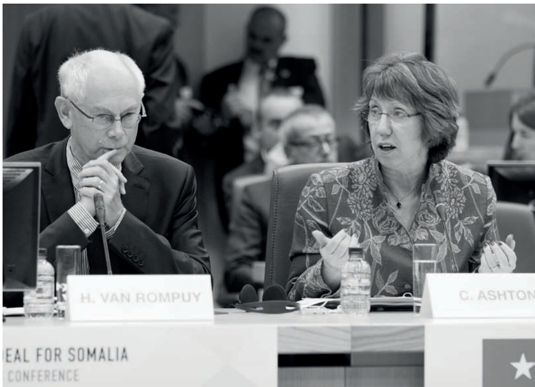
Herman van Rompuy (left) and Catherine Ashton in a conference on Somalia in September 2013.

of the chair diminished, as national administrations developed their own initiatives together with like-minded member states, and sent letters to the High Representative ahead of the foreign ministers meeting with concrete agenda points. It became increasingly difficult for the High Representative to balance between the legitimate concern of member states to see their priorities reflected at the EU level, and the need to concentrate on key topical issues of common interest and importance.