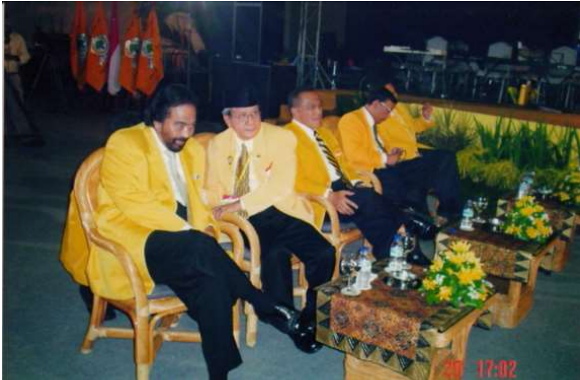
Left to right: Surya Paloh (now Nasdem), Akbar Tandjung, Aburizal Bakrie, Wiranto (now Hanura) and Prabowo (now Gerindra).