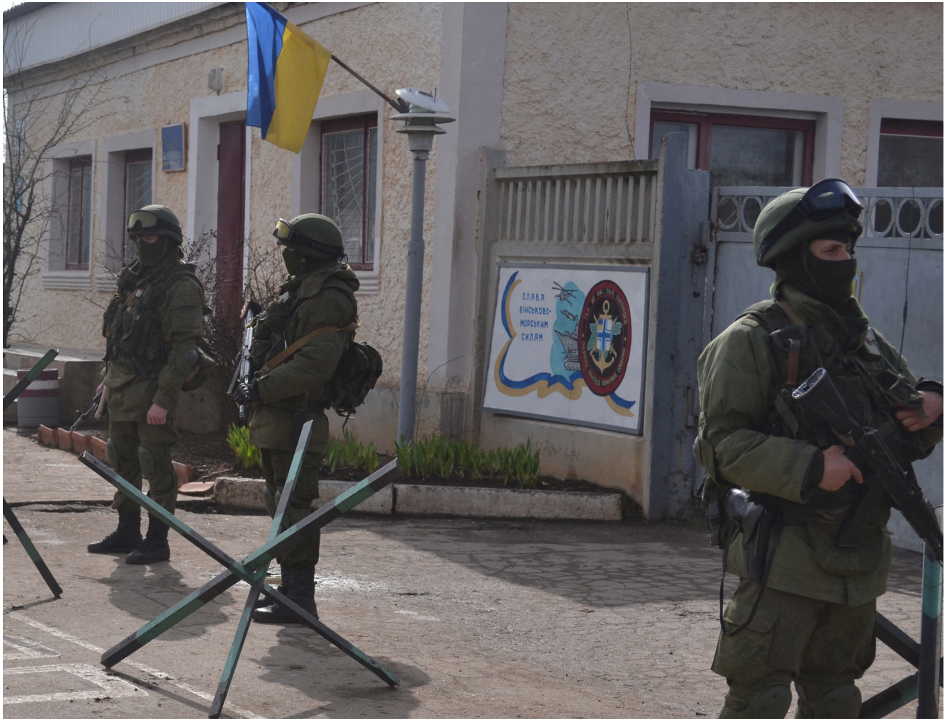
Undeclared Russian soldiers guard a military base in Perevalne, Ukraine. The Ukraine crisis brings additional urgency to the issue of NATO's future in a post-ISAF world.

scene, leaving the transatlantic community with less of a clear memory of what NATO has meant for transatlantic and global peace and security. Indeed, this was one of the key points made by then-Secretary of Defense Robert Gates during his farewell speech in Brussels in 2011.