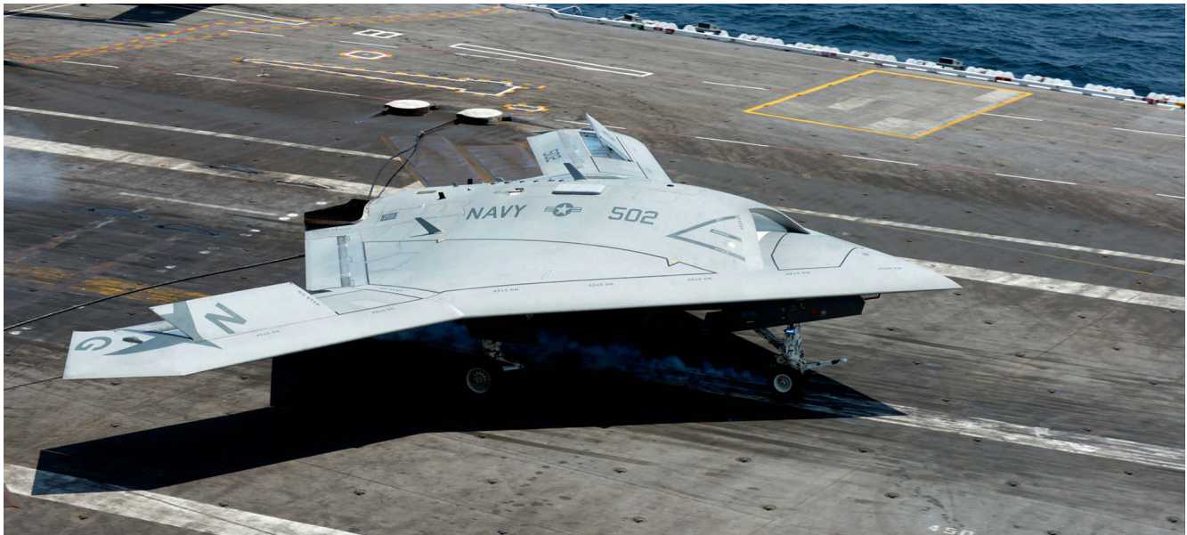
A drone touches down on a US aircraft carrier. Drones are one example of disruptive technologies that are increasingly capable and rapidly proliferating, even to nonstate groups.

Disruptive technologies will spur advances in operational concepts, battlefield tactics, and military equipment, which could generate future revolutions in military affairs. The twenty-first century is poised to see new iterations of emerging military technologies altering both tactics and strategy. This could reinforce the transatlantic community's current military advantages, if it is dedicated to maintaining its military technology edge, but also render them obsolete if emerging powers employ them in innovative and unanticipated ways.