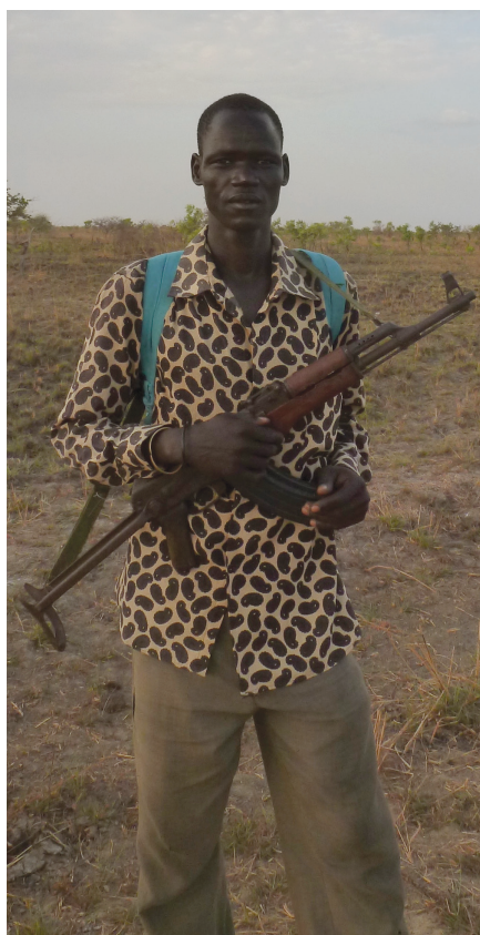
Armed Lou Nuer youth, Jonglei state, March 2013.

Ultimately, tensions are unlikely to be resolved until the underlying land dispute has been successfully negotiated and communities along both sides