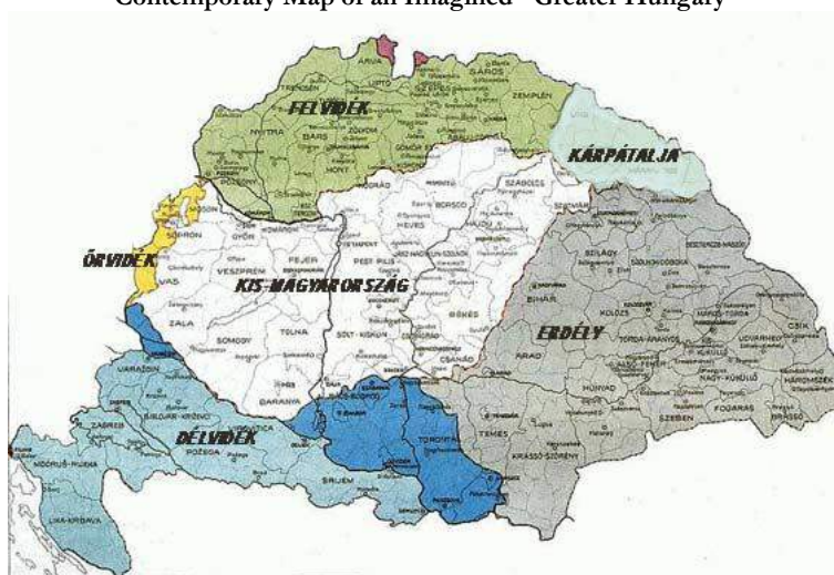
Contemporary Map of an Imagined "Greater Hungary"