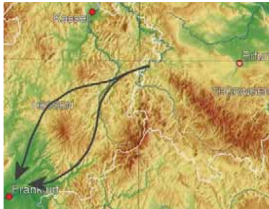
Author: Dual Freq, http://commons.wikimedia.org/wiki/File:Germany_topo_Fulda_Gap.jpg

Third, the Brown-Perry offset strategy was focused on a relatively narrow operational problem (i.e., a numerical imbalance in Soviet-NATO conventional forces, especially ground forces, in Central Europe) and a specific adversary, the Soviet Union. Today, the operational challenge to U.S. power projection capability is more multifaceted, and the number of prospective adversaries, as well as the scope of their respective military capabilities, is far greater. On the positive side, however, the United States also has a wide array of regional friends and allies aligned with it against commonly perceived threats. This advantage is magnified by the fact that several prospective U.S. adversaries (e.g., Iran, North Korea, Russia, and China) not only have no such alliances, but also face regional rivals that seek to keep them in check.