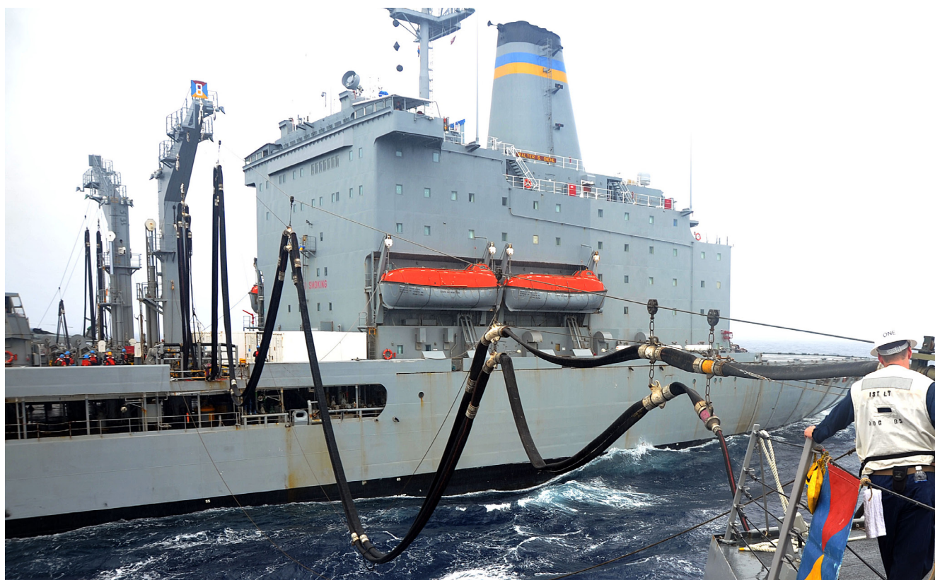
A Sailor looks on as a refueling probe pumps fuel into the ship during a replenishment at sea operation in the East China Sea.

and Industry (METI) official projects 20 percent of Japan's gas imports coming from the United States. 41 The United States' ability to bolster the energy security of Asian allies and partners would reinforce perceptions of US reliability and presence as an Asia-Pacific power. Australia, a close US treaty ally, is another major source of Asian gas exports. The combination of US and Australian gas contributing to East Asian energy security would be an important new strategic reality.