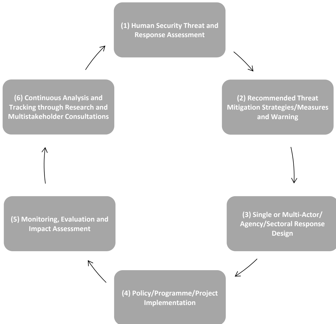
Figure 1 - Human Security Assessment, Warning and Response System Cycle